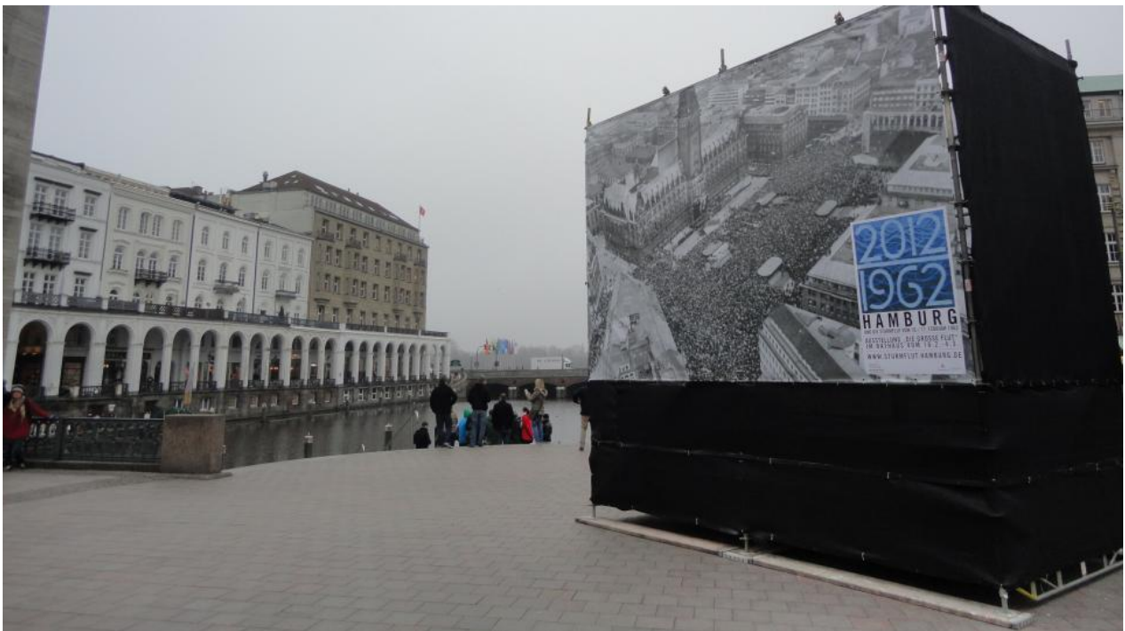
Temporary memorial during the 50th anniversary of the flood at Hamburg's Rathausmarkt

On 20 February 1962, some 150,000 people gathered on Hamburg's Rathausmarkt for a commemoration of the victims of the great flood that had inundated large parts of the city in the night of 16 and 17 February.