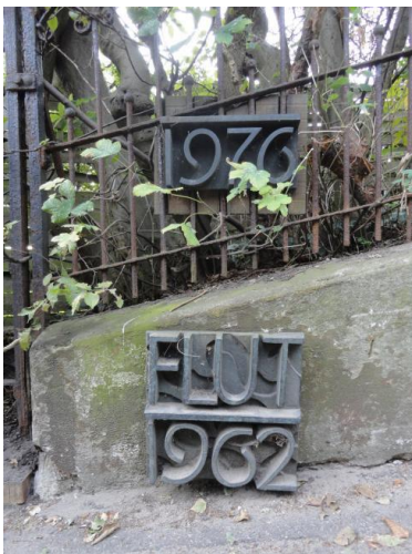
Flood memorial in Hamburg-Oevelgoenne.

memory became a veritable duty. A committee of experts responsible for dealing with the disaster warned the city against the perils of not being constantly aware of potential danger. Memories of previous storm floods had faded away —the last major flood, which took place in 1825, had occurred more than one hundred years earlier— allowing people to forget about the possibility of recurrence. Collective memory became more than just commemoration. It provided not only a historic perspective, but also a perspective for the future, functioning as a medium through which to cope with the disaster and to warn against and prevent the next storm flood. Still today, commemoration events and medial or material acts of remembrance make up an integral part of local and national memory culture. Elements of this “memory landscape” include speeches, memorials, high water marks, signs, newspaper articles, photographs, and films.