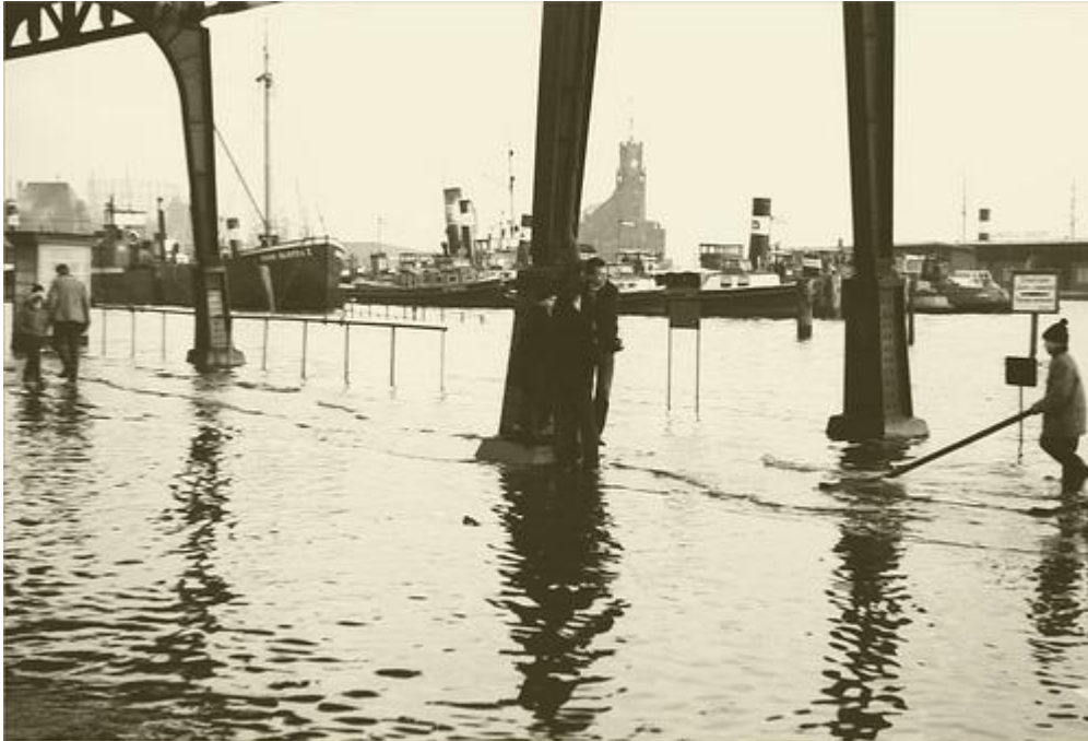
Flooded harbor area in Hamburg on February 17, 1962

construction of new flood protection installations, increasing the height and strength of old dykes, and the establishment of a contingency plan for disasters. Despite the numerous, similarly serious floods that have followed (among them, those in 1976, 1981, and, most recently, 2007), no comparable disaster has struck the North Sea coast since 1962.