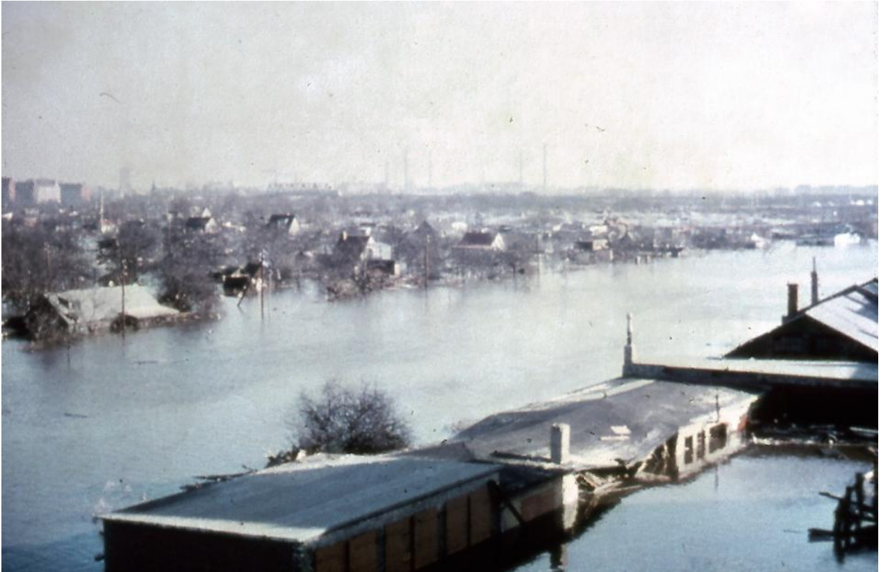
Photo of flooded city of Hamburg at Wilhelmsburg in 1962