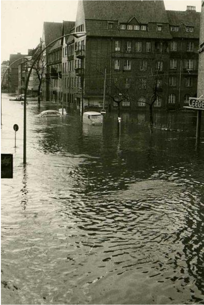
Flooded crossroad in Wilhelmsburg, 1962