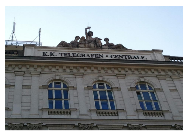
In the Viennese k.k. Telegrafen-Centrale flood warnings arrived from upper stretches of the Danube.