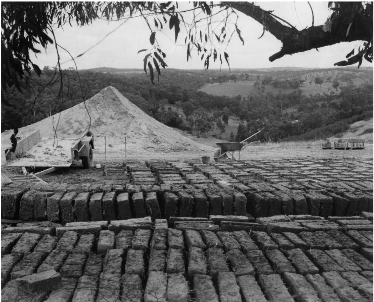
Mud bricks drying in the sun in the hills of Eltham (1960s)