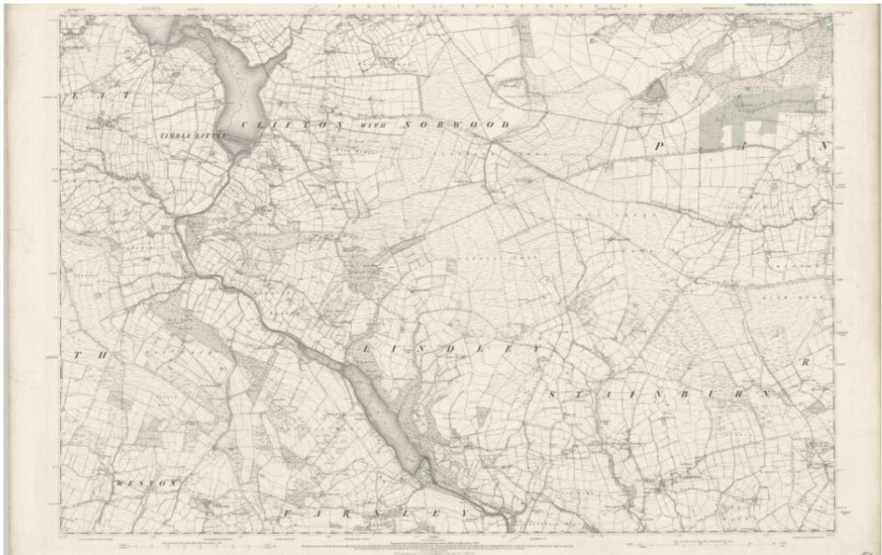
An Ordnance Survey map of the lower half of the Washburn Valley from 1893, with Lindley Wood (1869–75) in the middle, Swinsty (1870–77) in the top left corner, and the bottom of Fewston (1875–79) cut off in the top left corner.