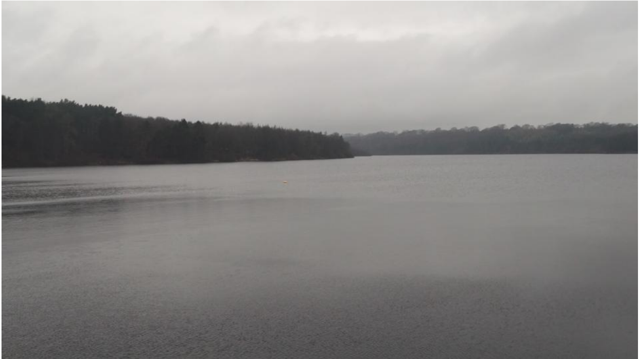
Swinsty Reservoir, on the banks of which Fewston village lies.