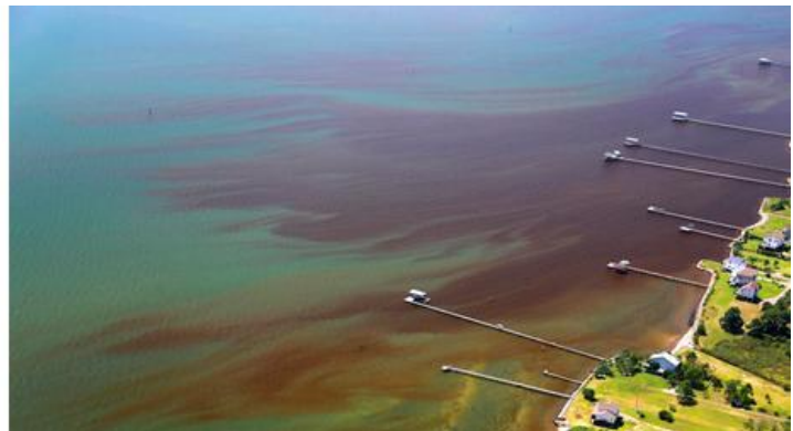
Toxic algae blooms.