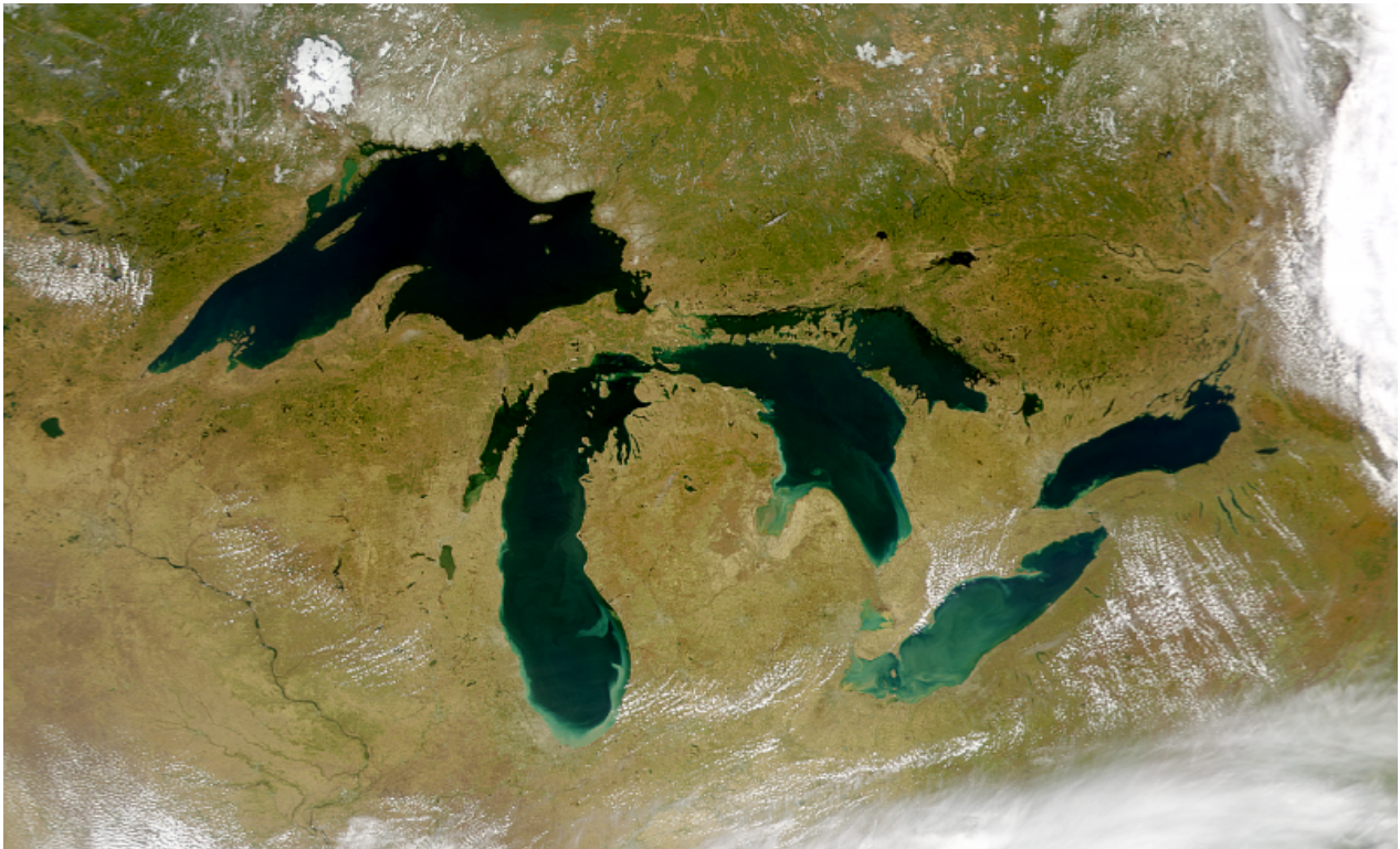
Fig. 2. Note the narrow rivers and straits connecting North America's largest freshwater bodies. During Pontiac's War (1763) these were the places where Native Americans and British soldiers fought and died in the highest numbers.

Historians of Pontiac's War have meticulously detailed the conflict's multi-causal origins. Factors that pushed Native Americans to violence included disputes over land, diplomatic insults, the disruption of French trade practices, the curtailment of gift giving, and the Delaware Prophet Neolin's pan-Indian spiritual movement. Indians participating in the attacks included Senecas, Delawares, Shawnees, Ottawas, Wyandots, Hurons, Potawatomis, Ojibwes, and Miamis. Recent scholarship on Pontiac's War illuminates how local factors, past experiences with British officials, and the disruption of the fur trade produced divergent Indian responses to the hostilities. Nonetheless, representatives from these nations coalesced into an effective military alliance whose accomplishments altered the trajectory of British North America.