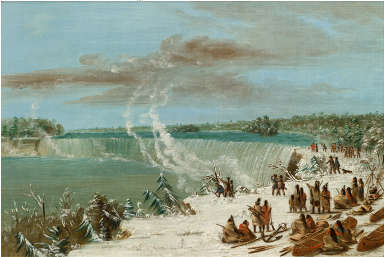
Fig. 1. George Catlin's mid-nineteenth-century painting of Niagara Falls illustrates the steep cliffs of the Niagara carrying place where Seneca warriors attacked vulnerable British soldiers travelling between Lakes Erie and Ontario.

Native American dispossession forms the bedrock of United States national history. Recent historians have complicated this narrative in their studies, showing the creative ways indigenous societies adapted, navigated, and contested centuries of Euro-American colonialism. Widening the discussion on indigenous dispossession, this article examines how Pontiac's War of 1763, perhaps the most famous episode of Native American resistance to British colonialism, was as much a struggle for North America's interior waterways as it was over lands.