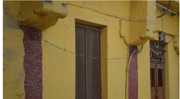
Fig. 4. Pegs on the walls of the temple that were once used to secure the theppa (float) used to celebrate the lake festival.

This work is used by permission of the copyright holder.