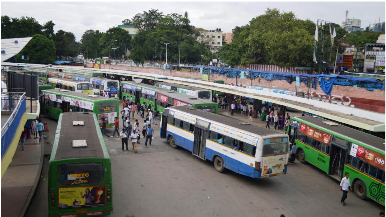
Fig. 1. Kempegowda bus station, Dharmambudhi Lake, 2017.

This is a story of Dharmambudhi lake, one of the first lakes built after Bangalore city was founded in the mid-sixteenth century. Today the city's central bus terminus, its transformation is so complete that it is difficult to find residents who remember that it was once a lake. Using a combination of archival documents and oral histories, we document the relationship that this lake has built with successive generations of city residents.