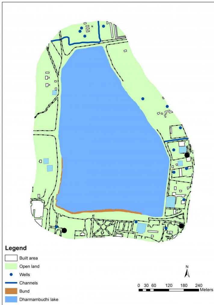
Fig. 2. Dharmambudhi Lake, 1885.