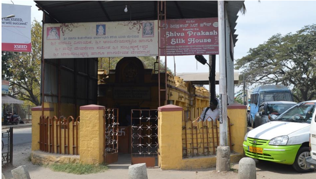
Fig. 3. The Varasiddhi Vinayaka temple dedicated to the lake deity associated with the Dharmambudhi lake. The first line of the board on the left states, in Kannada, “The temple located on the bund of Magadi Kempegowda’s Dharmambudhi lake.”

The lake was also an important sacred site for local festivals, including the city's most celebrated festival, the Karaga , which revolves around local water bodies. When the lake overflowed during the monsoon, a theppotsava was held in celebration (Figures 3 and 4). Oil lamps were made of rice flour, lit, and set afloat at night on the lake: a beautiful sight.