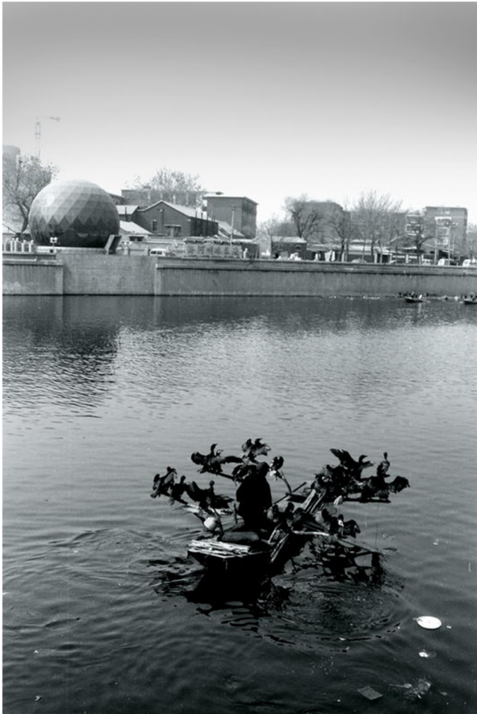
A fisher at Tianjin's three-river conjunction.