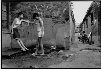
A shared water tap in the old-city area of Tianjin.