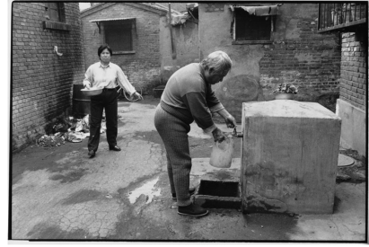
Residents using a shared running-water tap in the old city.

This work is used by permission of the copyright holder.