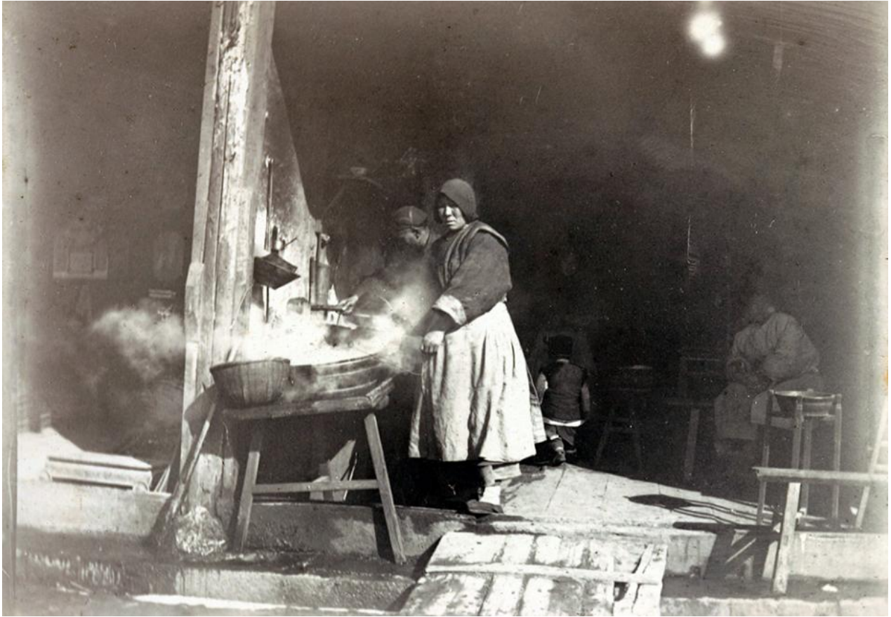
A Chinese hot-water shop, c. 1902.

Photograph by Charles Ewart Darwent, c. 1902.