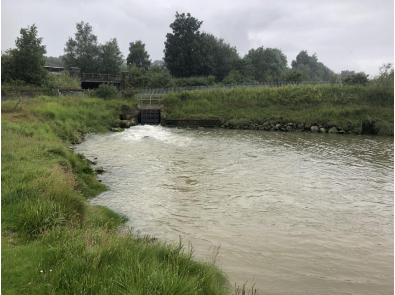
The outfall channel of the Milwr Tunnel near Bagillt on the Dee Estuary is known locally as “The Holy.”