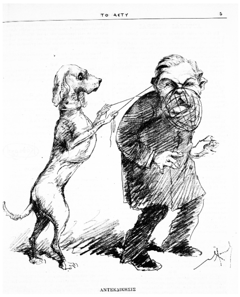
Comic strip titled "Counter-revenge," showing a dog putting a muzzle on the minister of the interior, Nikolaos Papamichalopoulos ( To Asty , 23 March 1886).