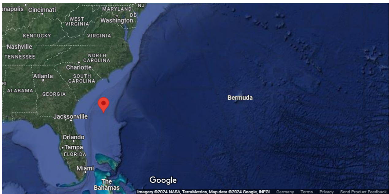
The approximate location of the Deepsea Ventures mining test site.