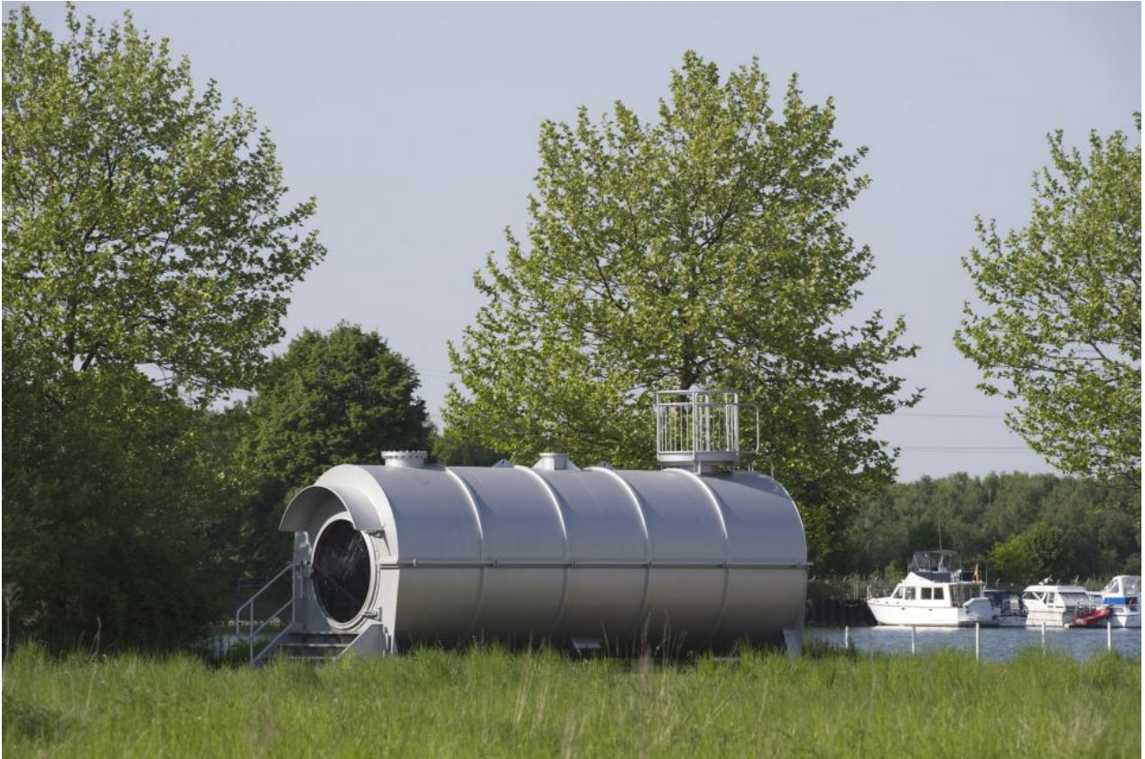
Society of Amateur Ornithologists by Mark Dion (2010)

The work further explores several themes that reoccur in Dion's oeuvre , regarding which, the observation station ( Blind/Hide: The Mobile Birding Unit , 2000) at the Tijuana River Estuary Reserve on the Mexico-United States border is a case in point.