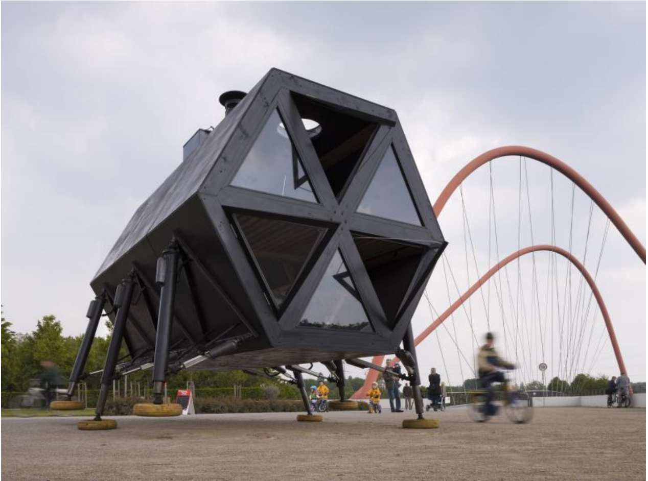
Walking House by N55 (2010), seen here at the former site of the Nordstern Mine in Gelsenkirchen.

Please click here for the manual that accompanies this work.