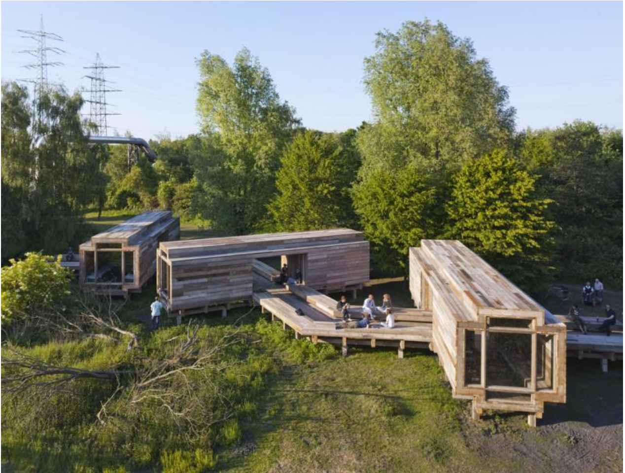
Observatorium's Waiting for the River (2010).

Since 1997, the artist group Observatorium is committed to create relationships between art, landscape and society. All rights reserved © Roman Mensing / EMSCHERKUNST.2010 . Used by permission.