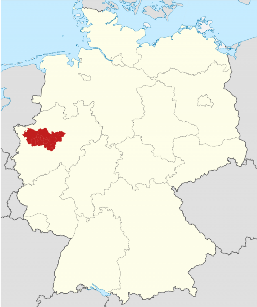
The Ruhrgebiet in Germany