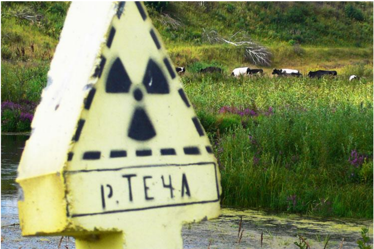
Cows by the contaminated river Techa

© Ecodefense/Heinrich Boell Stiftung Russia/Slapovskaya/Nikulina Click here to view Wikimedia source.