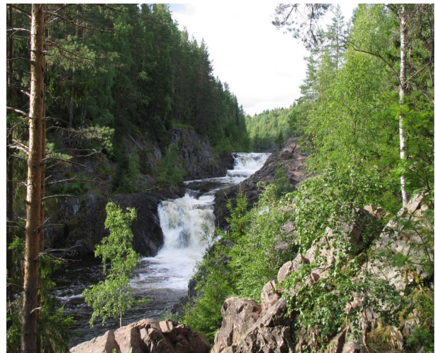
Photo of the Kivach waterfall showing the enormous transformation of stream and landscape after the construction of the Girvas dam (2008)