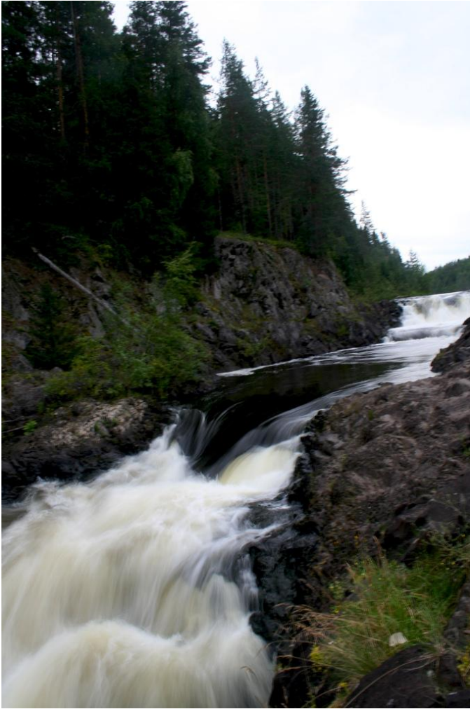
View of the Suna River and the Kivach waterfall