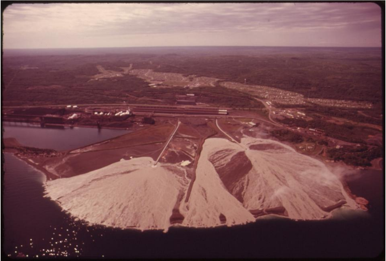
The slowly expanding tailings delta in Silver Bay, MN.