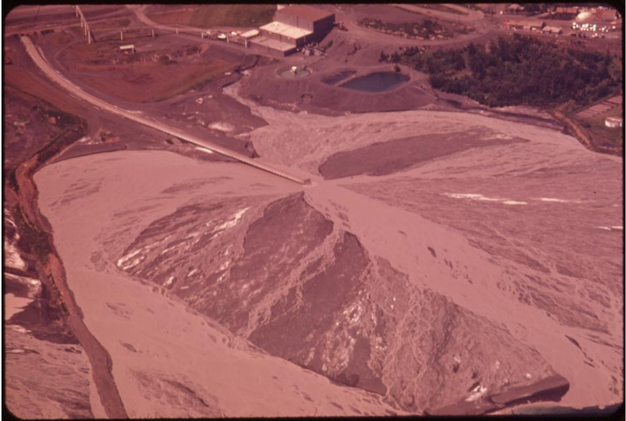
Taconite tailings from Reserve Mining Company are discharged via a chute into Lake Superior.

Reserve's trial lasted over a year, with appeals from Reserve keeping the case open until 1980 when they developed holding ponds for the tailings. The EPA and concerned citizens won out in a landmark case, which established regulations on industrial pollution. Reserve continued to operate for a few years before shutting their doors. Another company—NorthShore Mining—picked up where they left off, and they continue to utilize holding ponds to prevent tailings from entering the lake.