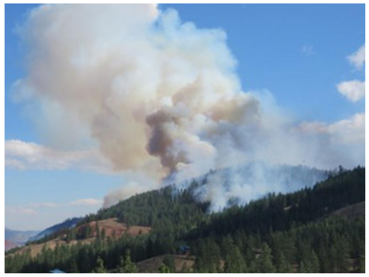
Fire near Winthrop, WA Photo by Sabine Wilke, 2015.

(CC) BY-NC-SR This work is licensed under a Creative Commons Attribution-NonCommercial-ShareAlike 4.0 International License .