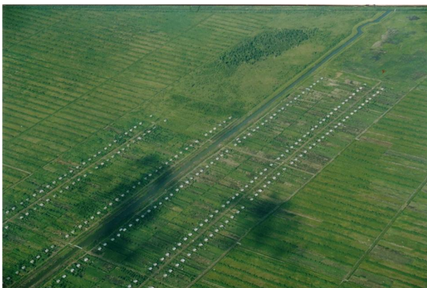
Aerial view of transmigrant housing and canals in the Mega Rice Project site, Central Kalimantan, 1997

Canal construction began abruptly in late January of 1996. During 1996 and through 1997, the Ministry of Public Works, with support from the Ministries of Transmigration, Forestry, and Agriculture, coordinated several thousand Japanese-made excavators and tens of thousands of workers to dig 6,000 kilometers of canals and clear vegetation across one million hectares of peat swamp forest. As part of Indonesia's long-running transmigration program, roughly 40,000 Javanese and Balinese farmers were each given 2.5 hectares of land to transform the deep, acidic peat soil into lush agricultural fields for wet rice cultivation. Few of these transmigrants harvested much rice, however. The nutrient-poor peat soils were ultimately unforgiving, and most Javanese and Balinese farmers were ill-prepared for this peatland ecosystem. Despite the project's reliance on smallholder farmers, the Mega Rice Project was foremost a failed commercial scheme. Government planners had vastly overestimated the extent to which small farmers could manage a complex ecological system.