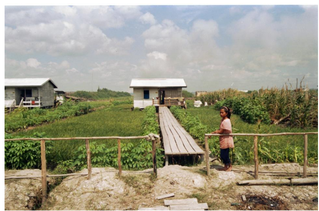
Javanese transmigrant housing and subsistence gardens, Mega Rice Project site, 1997

This work is used by permission of the copyright holder.