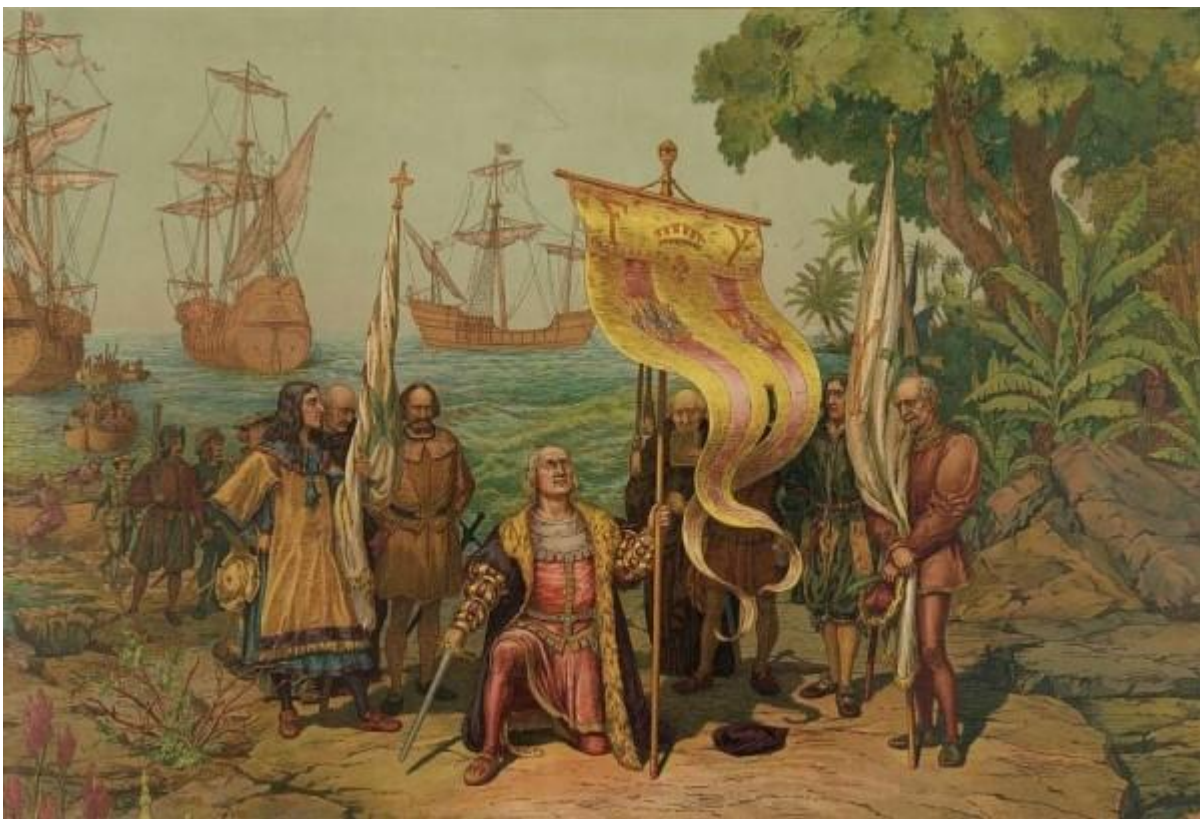
Christopher Columbus's landing at San Salvador in 1492: This image shows a nineteenth-century European depiction of Columbus's "discovery" of the Americas. Early European narratives around the "Columbian exchange" cast Europeans as the primary actors, and minimized the perspectives of Indigenous North Americans. This trend was also reflected in the early discourse surrounding the origins of syphilis.

important question with implications for the history of environmental interactions and the coevolution of human and bacterial populations. The three leading hypotheses propose that 1) treponemal diseases like syphilis either originated in the Americas and arrived with Columbus, 2) that they were already present in Europe but were not recognized as separate diseases until the end of the fifteenth century, or 3) they originated during the Paleolithic era and migrated along with all human populations. Much of the evidence for pre-Columbian skeletal cases of syphilis in both the Old and New Worlds, including some discovered by Jones, has been criticized due to difficulties in distinguishing different disease processes in ancient skeletal remains, the absence of reliable archaeological contextual information, and the incomplete nature of the skeletal record. However, since Jones's discovery effectively brought paleopathology into this debate, human skeletal remains represent an important form of evidence for addressing the question of origins. While there is abundant evidence for some form of treponemal disease in the Americas before European contact, none of it clearly identifies venereal syphilis specifically. With increased analytical focus on European skeletal material, cases are increasingly being discovered in pre-Columbian Europe. Despite this, the idea of an American origin has persisted.