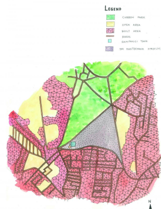
Fig. 3. Map of Sampangi lake and its surroundings in the year 2014 © 2017 Shubhika Malara & Hita Unnikrishnan. Illustration by Shubhika Malara, based on maps created by Hita Unnikrishnan.

This work is used by permission of the copyright holder.