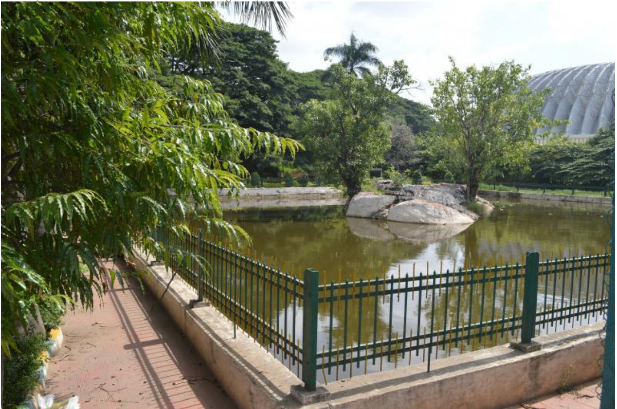
Fig. 1. The small remnant water body of today overshadowed by the distinctive dome of the Sri Kanteerava Stadium

In this article, we narrate the story of how Sampangi Lake, a central lake that was once a very important component of the city's water supply, became a contested site fought over by British polo players and Indian orchard owners. It later transformed into a sports stadium, which ironically also is the site of water conservation meetings today.