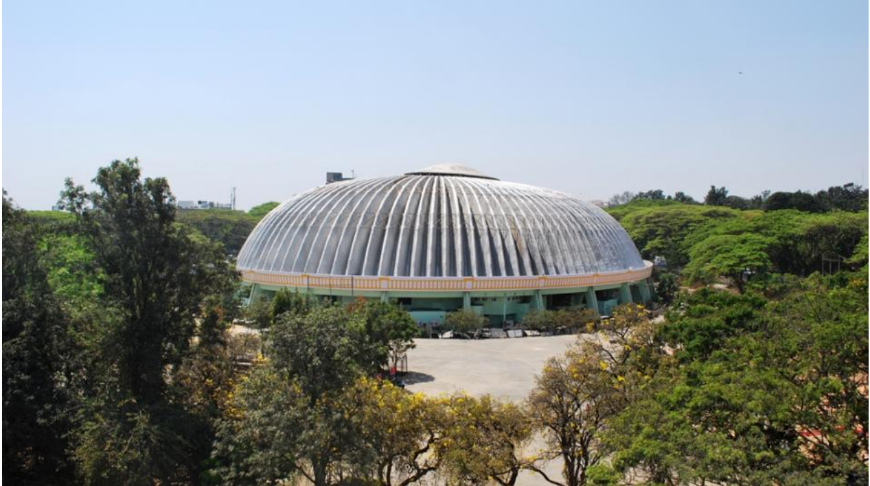
Fig. 5. Sri Kanteerava Indoor Stadium in 2012

land prices, and a change in perception of the utility of the lake catalyzed its conversion into a built-up space. As Bangalore grew into a twentieth-century city with an aspirational modern identity, the lakebed was converted into the Sri Kanteerava indoor sports stadium. The landscape around Sampangi now retains little of its former ecological and social importance. Only the small rectangular tank of water remains, because of its centrality to the Karaga festival.