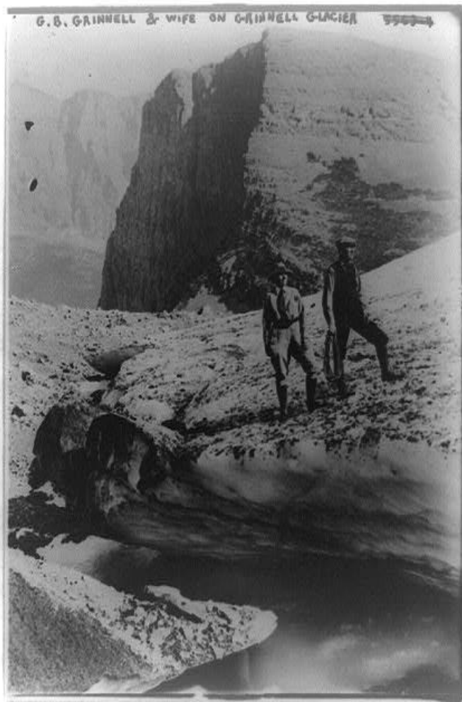
George Bird Grinnell and his wife on Grinnell Glacier, 14 March 1925

Click here to view source.