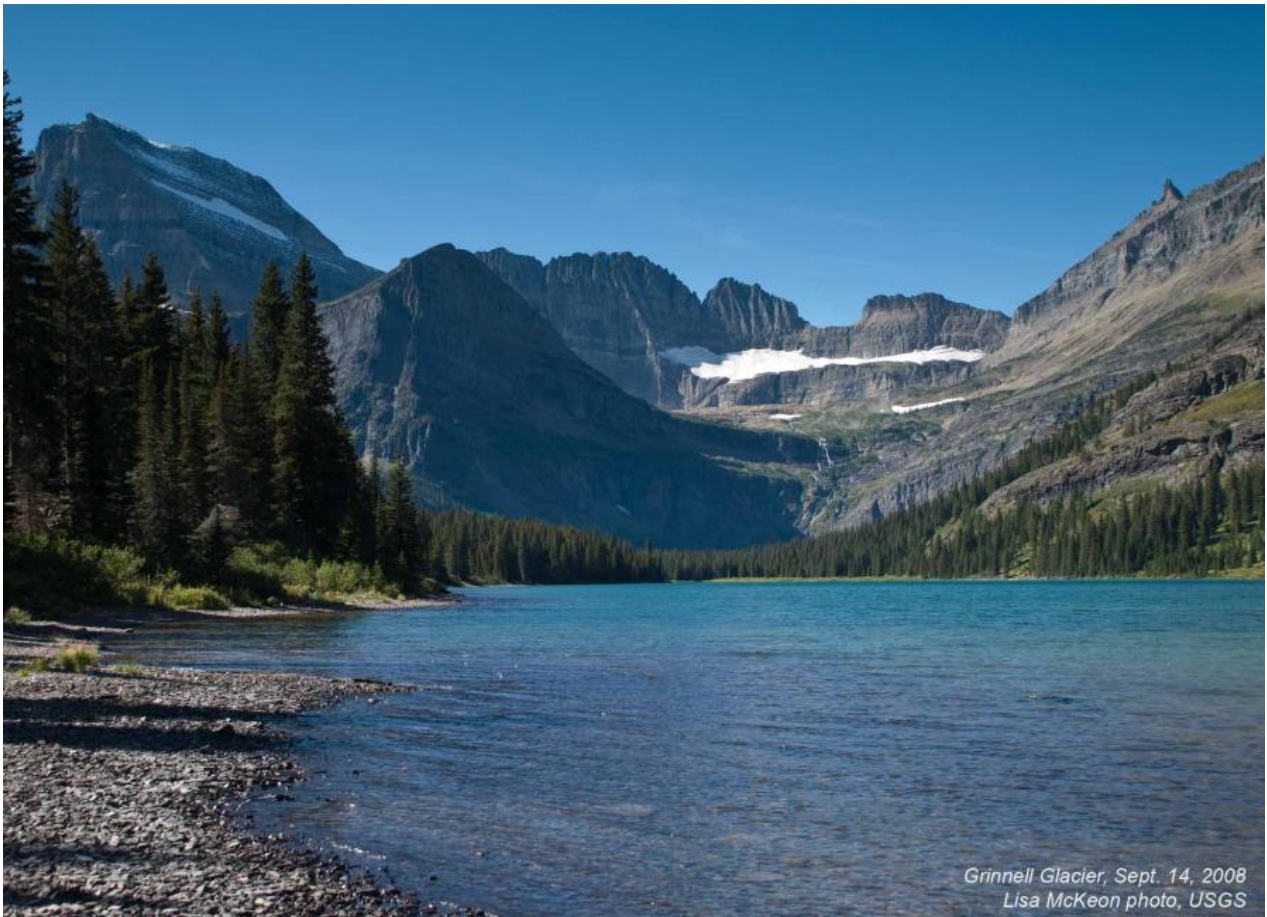
Grinnell Glacier, Sept. 14, 2008

Grinnell Glacier from the shore of Lake Josephine in 2008. Click here to view source.