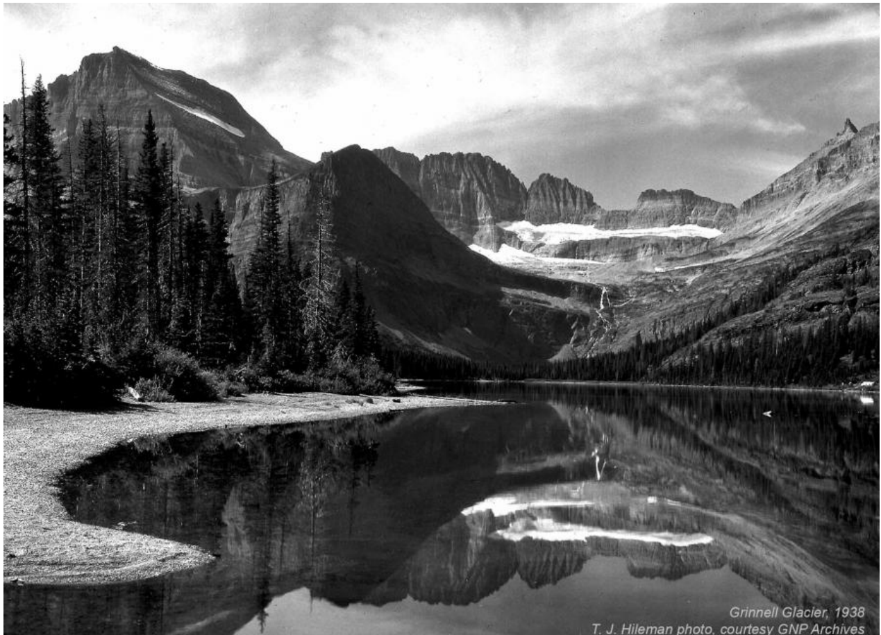
Grinnell Glacier from the shore of Lake Josephine in 1938.

Photograph by T. J. Hileman. Courtesy of the Glacier National Park Archives. Click here to view source.