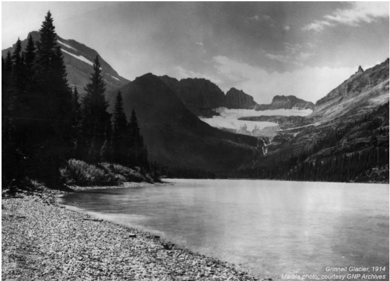
Grinnell Glacier from the shore of Lake Josephine in 1914.

Photograph by Marble Photo. Courtesy of the Glacier National Park Archives. Click here to view source.