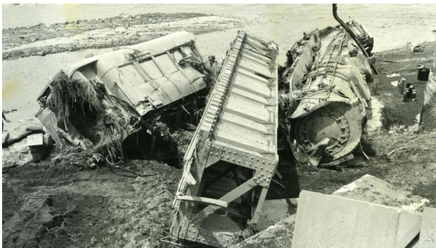
The locomotive, one of the bridge girders, and part of the third carriage, 25 December 1953.

On Christmas morning 1953, an express train from Wellington, New Zealand, was meant to arrive in Auckland. It never did. At 11:21 p.m. the previous evening, it plunged into the Whangaehu River at Tangiwai in the central North Island. Of the 285 passengers on board, 151 died, eclipsing the 21 fatalities at Hyde in 1943 to make it New Zealand's worst railway disaster—and one of the world's worst.