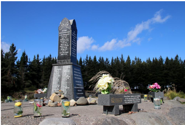
A memorial listing the 151 victims was erected in 1989; the flower stations dedicated to survivors were added this decade.

Tangiwai both shaped and fits a narrative of environmental tragedies in New Zealand as unforeseen and sudden. This is somewhat inaccurate and shorn of its class dimension, but it resonates with personal experiences of disruptive horror.