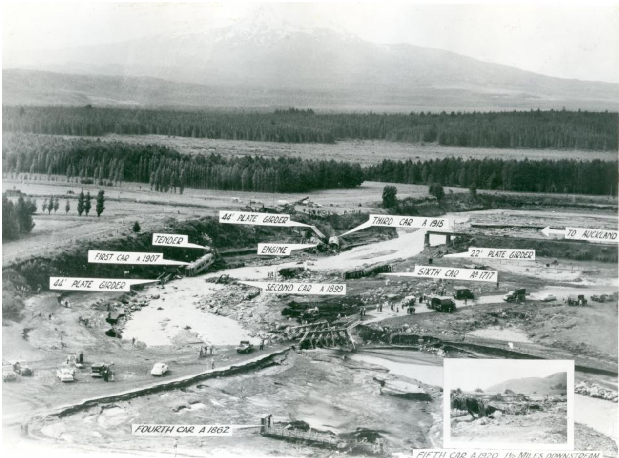
Labeled press photograph of the site of the tragedy, looking towards Mount Ruapehu, 25 December 1953.