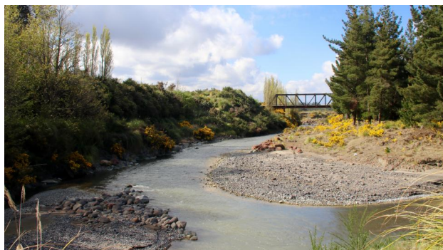
Tangiwai as seen in 2018, looking from the disaster memorial up the Whangaehu River to the new railway bridge. The first carriage came to rest on the bank at left, the second carriage in the bend of the river.