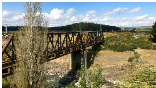
The new bridge built after the disaster still carries the North Island Main Trunk Railway across the Whangaehu River. The ill-fated express approached from the opposite bank.

This work is licensed under a Creative Commons Attribution-ShareAlike 4.0 International License .