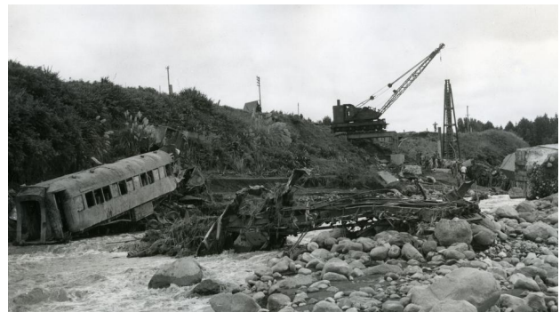
The wreckage of the second carriage sits in the foreground; to the left is the largely intact first carriage, 27 December 1953.

This work is licensed under a Creative Commons Attribution-ShareAlike 2.0 Generic License .