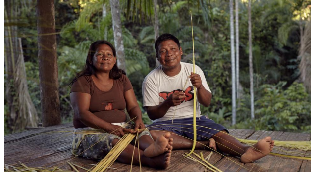
Sustainably extracting fiber from a rainforest palm tree in Maijuna lands.

The copyright holder reserves, or holds for their own use, all the rights provided by copyright law, such as distribution, performance, and creation of derivative works.