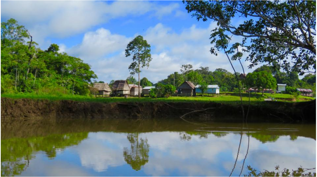
Sucusari, a Maijuna community on the Sucusari River in Loreto, Peru.