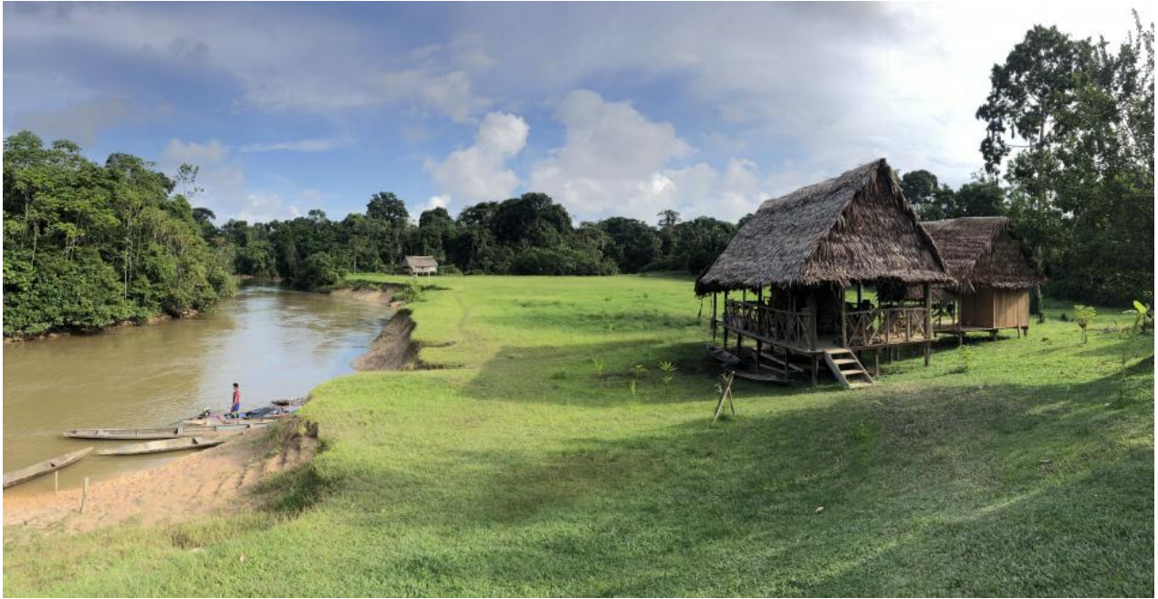
A traditional Maijuna house in the Sucusari community.