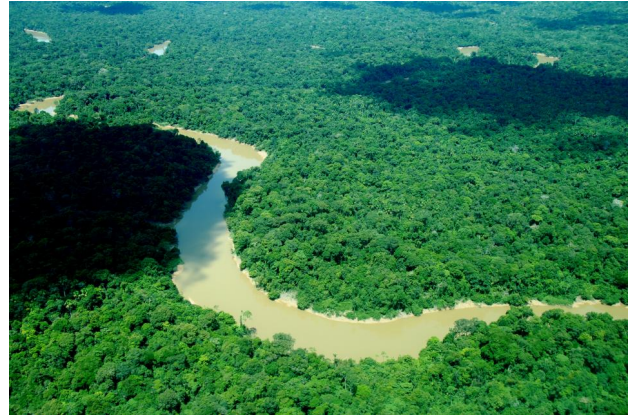
The Algodón River, a vital resource to the Maijuna for fishing and transportation.