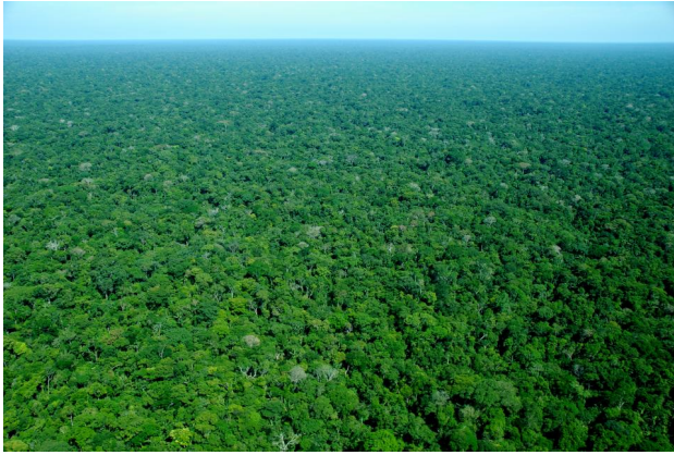
Primary rainforest in Maijuna ancestral lands.