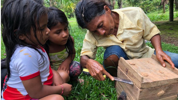
A Maijuna grandmother beehiving with her granddaughters.

and study the resulting impacts on key wildlife species. Camera traps and GPS-based hunter tracking studies have indicated a resurgence of ecologically and culturally important wildlife, including monkeys, tapirs, jaguars, and peccaries.