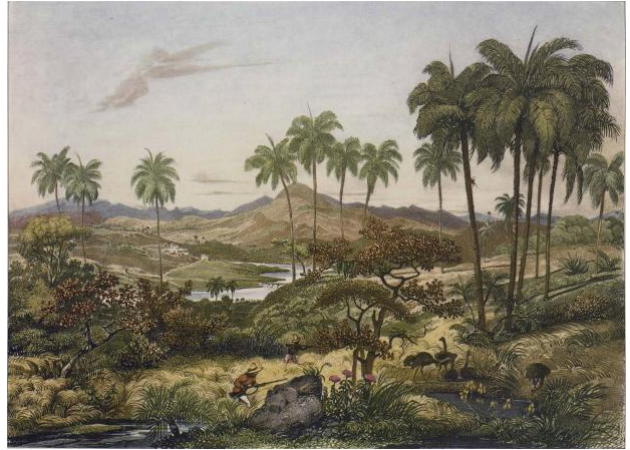
Illustration of vegetation in Minas Gerais. Johann Moritz Rugendas and Alexis Victor Joly, 1835.