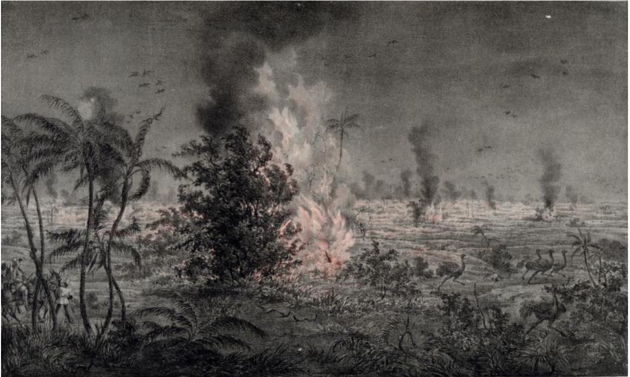
The burning of the campos vegetation in Minas Gerais, Brazil. Carl Friedrich von Martius, c. 1840.

favoring botanical-geographic studies of particular places combined with sensory experiences from the field, in dialogue with travelers. Although iconography of the Brazilian Highlands at that time depicts most often towns, two Bavarian travelers are among the few who recorded the vegetation of this region, as well as its environmental transformations—in direct exchange with Humboldt.