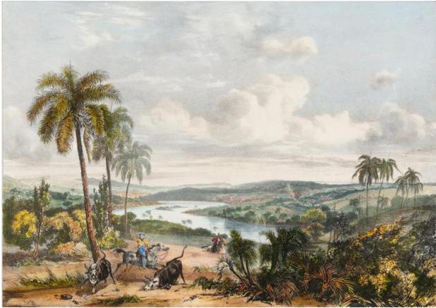
Illustration of vegetation and settler life in Minas Gerais. Johann Moritz Rugendas, Victor Adam, and Richard Parkes Bonington, 1835.