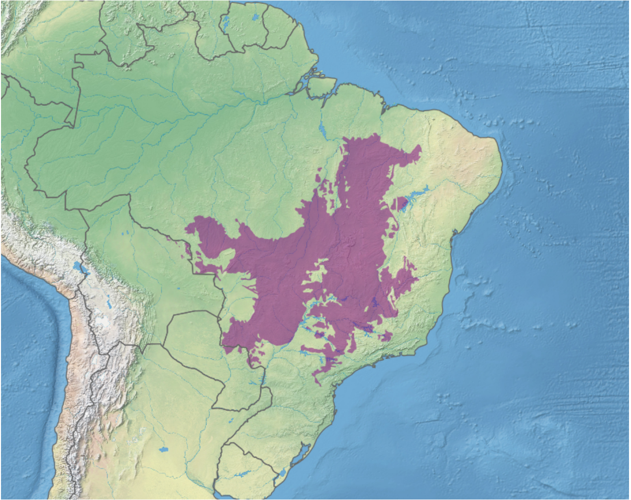
Map of the Cerrado ecoregion as delineated by the World Wide Fund for Nature (WWF).