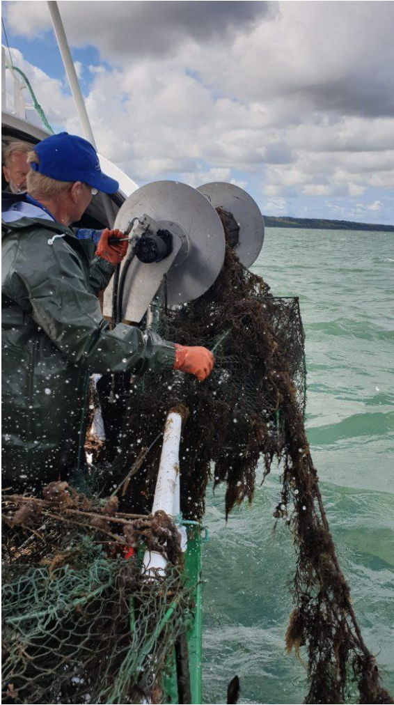
Bringing in a ghost net on the boat Anton .