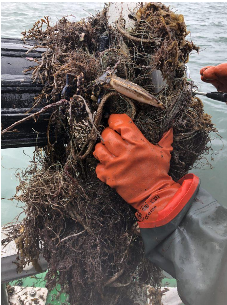
A claw caught in a ghost net.