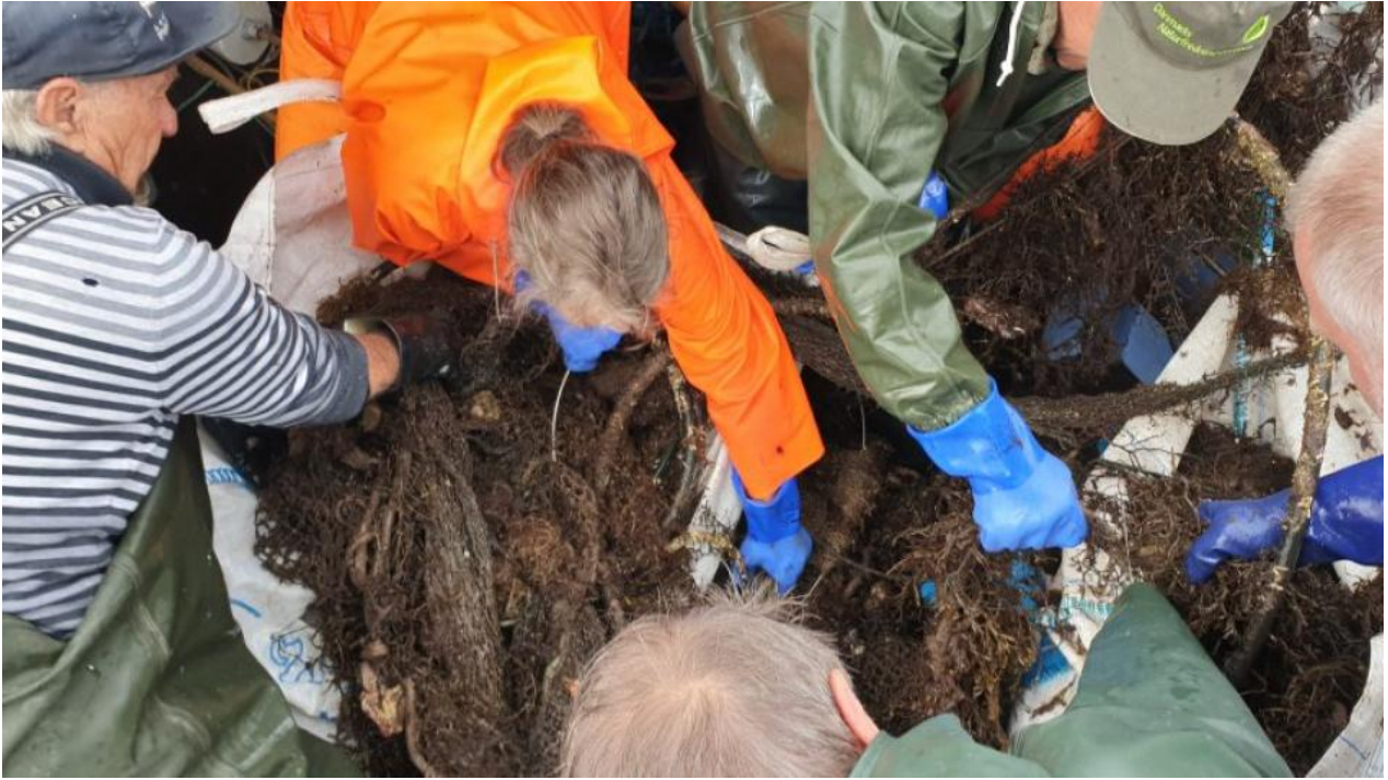
Bags of forgotten prisons.