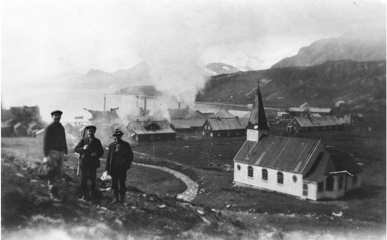
Hunting party at Grytviken in South Georgia, 1925.

staffed mainly by Norwegian seasonal employees. Other whaling entrepreneurs followed Larsen's example and by 1917 there were a total of six whaling stations on South Georgia. Each station employed several hundred Norwegian seasonal workers during the austral summers. Although the industry was international, it was dominated by Norwegian traditions and culture as can be seen by the whaler's church in Grytviken or the remains of several ski jumps at the stations. With landscape and climate at least somewhat like northern Norway and no land-based mammals living on South Georgia, Larsen decided in 1911 to bring a first group of reindeer from Norway. The idea behind the introduction was to provide the seasonal workers with a local fresh meat supply and an opportunity to hunt as a leisure activity, an antidote to the strenuous and monotonous work at the whaling stations. A second group of reindeer was brought to the island in 1912 and a third group in 1925. Despite one of the three introduced reindeer herds being eradicated by an avalanche, the animals adjusted quickly to the conditions of South Georgia. The herds grew slowly but steadily. Reindeer hunting became a popular pastime among the whalers and thus the herds did not grow too much, but were de facto effectively managed.