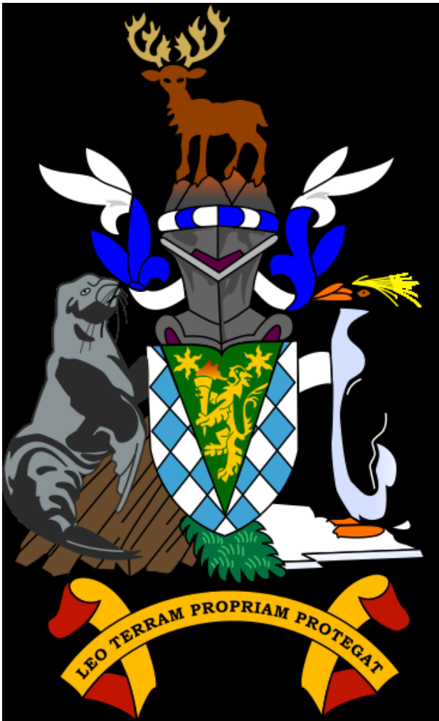
Coat of arms of South Georgia and the South Sandwich Islands.