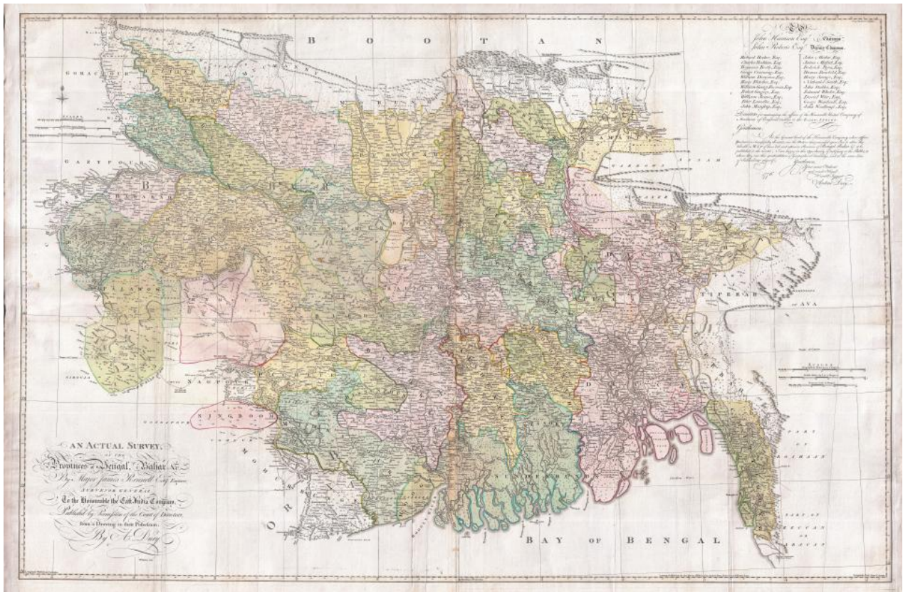
James Rennell's Map of Bihar and Bengal in 1776. It is one of the first accurate maps laid out from primary surveys done by James Rennell after the East India Company got the revenue collection rights of Bihar, Bengal, and Orissa from the Mughals.

Bihar province was organized into seven administrative districts known as sarkars. The demarcation of these districts was heavily influenced by the region's prominent rivers, underscoring the pivotal role of geography in the administrative structure of the time. Each district was linked to a specific river floodplain, contributing to its high agricultural productivity. Mughal rulers appointed distinct revenue officers, therefore, to oversee revenue collection in each district. The river channels served as conduits for internal trade and grain exports. The Ganga River, with its navigable routes and extensive connectivity to all districts, played a pivotal role in facilitating the transportation of goods, enhancing the region's economic activities and trade networks.