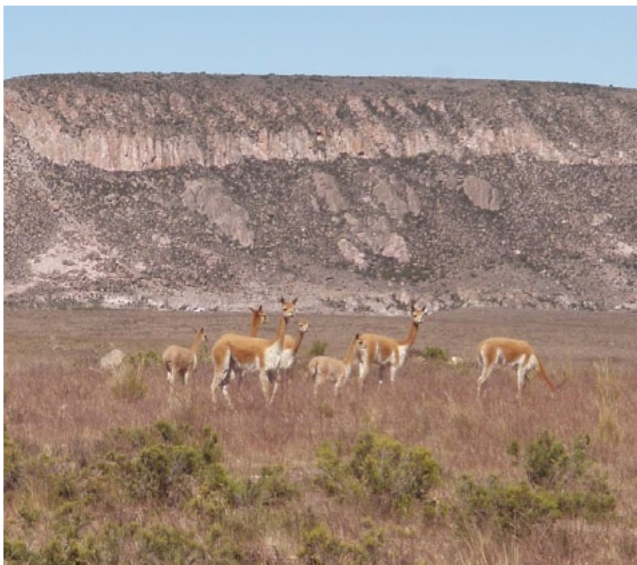
Figure 2: Vicuña grazing in Pampa Galeras Re- serve, Ayacucho, Peru, 2009.

There is a tension between the various levels at which we can (and cannot) gain knowledge about nonhuman organisms. On the one hand, there are scientific studies of humans' influence on other species and historical studies of the influence of other species on human lives (this influence is particularly strong for microbes, pathogens, and disease vectors). At the same time, there is much we cannot possibly know about other organisms' inner lives or orientations. The challenge for environmental history, then, is to mine the conjuncture between these fields of knowledge. Edmund Russell has recently argued for greater attention to evolutionary history, a field that "studies the ways populations of human beings and other species have shaped each other's traits over time and the significance of those changes for all those populations." 23 Russell points out that evolution is