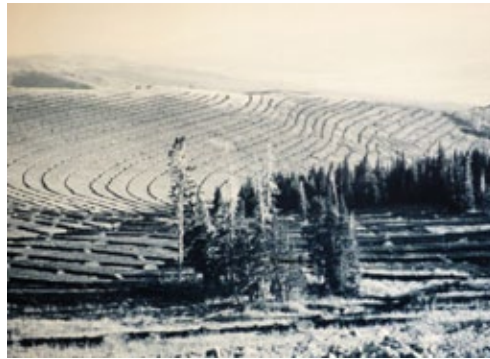
Figure 2: Restoring watersheds in the Utah Rockies with contour trenching, ca. 1930. W. Bailey and A. Croft, "Contour Trenches Control Floods and Erosion on Range Lands," United States Forest Service Publication 4 (1937).

There was the other pragmatic fact that in those graduate school days, I consumed most of my jet fuel traveling back and forth between my selected mountain ranges. My family lived at both ends of this mountain divide, and I would be making my way between these ranges regardless of which doctoral project consumed me. Such family issues also meant that language, too, was working on my side, for I realized that dealing with obscure archival records would require a good command of the local vernacular; fortuitous earlier circumstances meant that I could handle Romance tongues reasonably well but not Germanic ones. Clearly my research questions and my study sites in the Alps were better centered on valleys draining into the Po and Rhone than into the Rhine and Danube. While I admire those who simply throw a dart on the world map and then set out to learn more about that place, I did not want to spend extra graduate school years just acquiring another language or two before I could begin to wonder which questions might be asked.