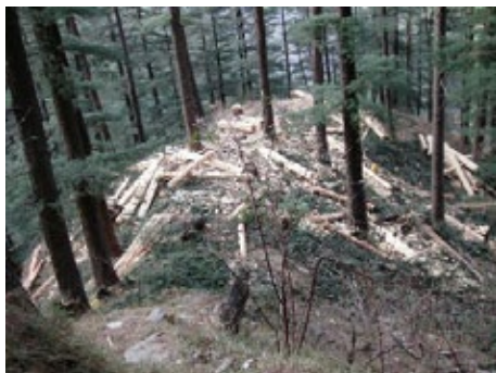
Figure 4: Ground fire in pine forest.