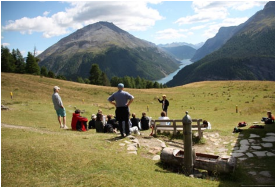
Figure 1: During an excursion to the Swiss National Park, the author describes the history of the park to students and colleagues. The excursion was part of the 2013 ESEH summer school “Mountains Across Borders” in Lavin, Switzerland.

environmental history in any landscape. The essays thus form a guidebook that might help scholars to navigate the proverbial landslides, river crossings, and poorly marked trails that characterize the metaphorical mountains of environmental history research. But as these contributions also show, rising to these challenges is not only necessary but also very rewarding. To a great extent, our motivation in collecting these essays has been driven by our hope to give some guidance to young and, perhaps also, more experienced colleagues in traversing the professional terrain of environmental history. 4