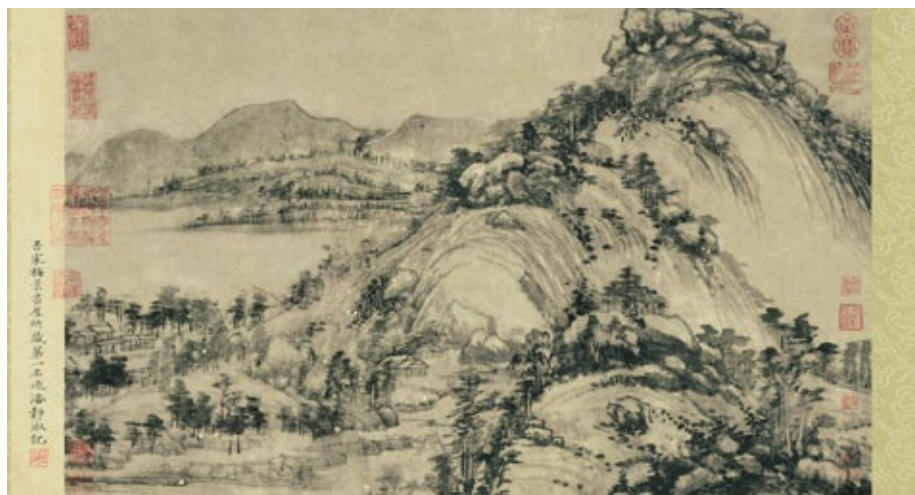
Figure 4: The first part of "Dwelling in the Fuchun Moun- tains" by Huang Guangwang (1269–1354). Ink on paper hand scroll, currently kept in the Zhe- jiang Provincial Museum in Hangzhou.

Strength, endurance, and terror are amongst the qualities attributed to mountains by us Chinese, and these qualities are also a part of China's invisible mountain. This is certainly a mountain in perception, and has a variety of meanings and imagery. The invisible mountain includes Jon's analyses of the two structurally opposing phenomena. The imagery of mountains in ancient Chinese poetry has been an interesting subject of research. It had a lot of metaphorical applications—holiness, eternity, barriers, morals, refuge, and so on. Ancient poetry including mountain imagery is an important part of Chinese mountain culture, and has a special value for us due to its exploration of Chinese perceptions of nature. Landscape drawings are also very important and valuable sources for this investigation because they have the characteristics both of tangible and invisible mountains. I give here an example painted by the famous Yuan Dynasty painter Huang Guangwang in the mid-fourteenth century.