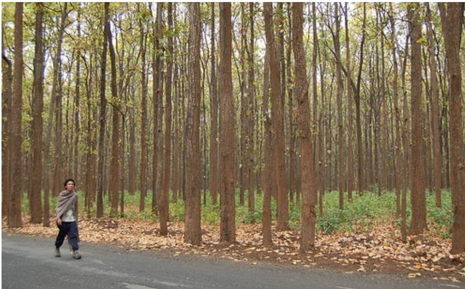
Figure 2: Hardwood plantation, gov- ernment forest.

It seemed straightforward at first, studying the history of deforestation in one of the world's greatest and most fragile mountain regions. But the work led inexorably on to more complex issues. Forests are more than trees, mountain societies have always relied upon more than wood products for their development, and mountain ecosystems are impacted in vastly intricate ways. Under British rule traditional access to forests was redefined according to colonial forest law (imported models based on early modern German laws), which required written permits that villagers could obtain only from local forest officials. This meant the bureaucratization of village life, with its attendant delays, frustrations, and opportunities for corruption. In the rivalries between