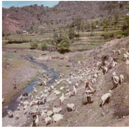
Figure 5: Migratory sheep.

varied widely from one sub-region to another) their men were also shepherds, taking large flocks of sheep and goats to alpine summer pastures as much as two high ranges to the north. The animals produced wool and meat, including enough wool to sell as a cash crop in lowland markets. The shepherds knew alpine pasture ecology better than anyone else, but their increasing numbers (though the trend in numbers was also contested) put pressure on young trees in the understory of forests. The British attempted to regulate the migratory flocks, recognizing their centuries-old significance and attempting to manage both the forests and social conflicts, but the relationship was never harmonious. One essential dimension of this transhumance rhythm was the shifting relationship between upland shepherds and their lowland wool buyers, one of the most important economic links between the two regions. 8