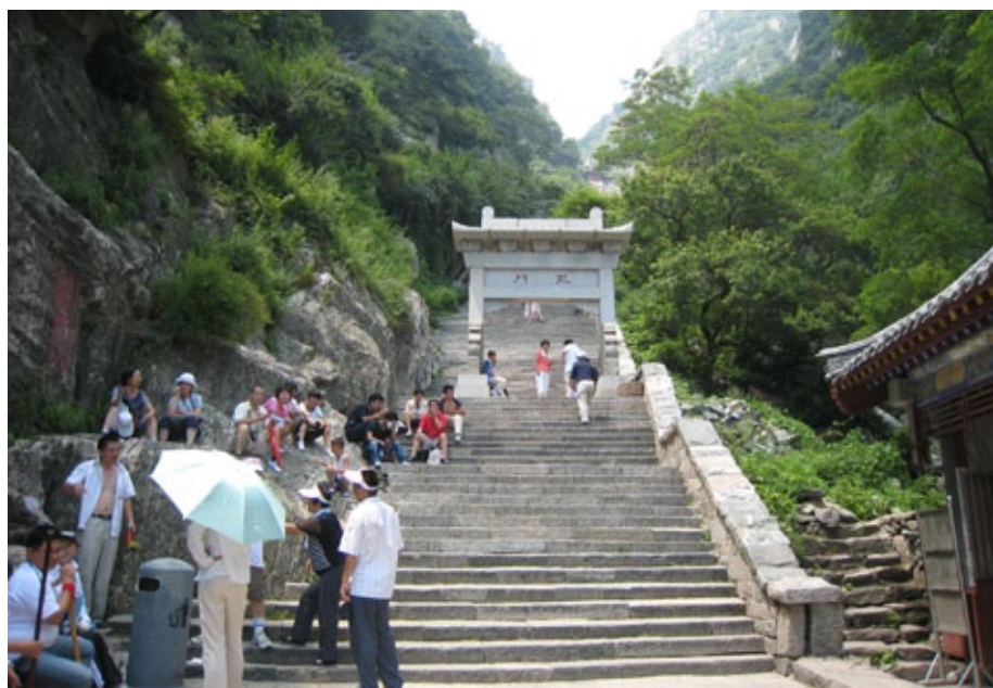
Figure 1: Mount Taishan, Shandong Province, in 2007. At that time the mountain was likely visited by more than six million people per year.

At this famous place one could also pay homage to the Deity of Mount Taishan itself. Emperor Wanli did this only from a distance and never personally undertook the pilgrimage. However, three of his successors visited the Eastern Mountain in the seventeenth and eighteenth centuries. They left behind numerous inscriptions, including some which were related to the mountain deity himself, for example: “The Associate of Heaven Who Is the Guardian of the Empire” (1684) and “Tai Peak Bestows Happiness upon Us as a Reward” (1731). These attributes were in keeping with popular ideas that were widespread in China. In numerous cities and villages of the empire there were temples dedicated to Mount Taishan, in which written characters emphasized the mountain’s godly qualities: “His holy virtues equal those of heaven,” “His godly power rewards and punishes,” and “to escape His deep sight is difficult.”