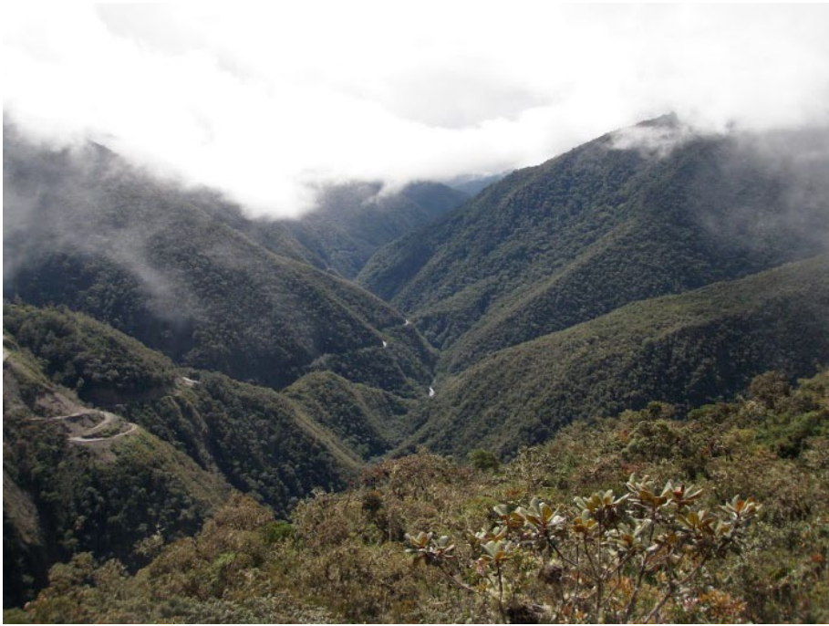
Figure 3: Road descending Andes into Amazon basin, Manu Na- tional Park, 2011.

Manu National Park, created in 1973 in Peru's western Amazon, is a park known for its biodiversity. 25 Among its quantitative attributes, the park boasts 10 percent of the world's species of birds, 15 percent of its butterflies, and 20 percent of its flora. The key feature of the park that captures this range is the inclusion of a portion of the Andes mountain range in combination with the lowland forest. By stretching up extreme gradients, the park catches a wide range of life forms. But the park also has amazing cultural diversity.