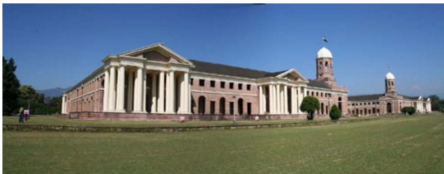
Figure 1: India's Forest Research Insti- tute, Dehra Dun.

The changeable political history of the Himalayan region has had the result of dispersing historical records in many locations. This presents researchers with many kinds of difficult conditions. Administrative archives in the region are mostly underfunded, understaffed, and only partially organized. In India I often frequented the Indian Forest Service library in Dehra Dun, as well as several Forest Department district offices. For the evolving political context, briefer visits to the National Archives and Nehru Memorial Library in New Delhi were in order. Access to Princely States' records, including important portions of the western Himalayas, is much less orderly; I had to leave that work to Indian colleagues who were much better positioned to pursue the unpredictable process of finding whether any former royal archive had useful materials or not. For broader Himalayas-wide perspectives, the research facilities at ICIMOD (the International Centre for Integrated Mountain Development) in Kathmandu are highly valuable. 4