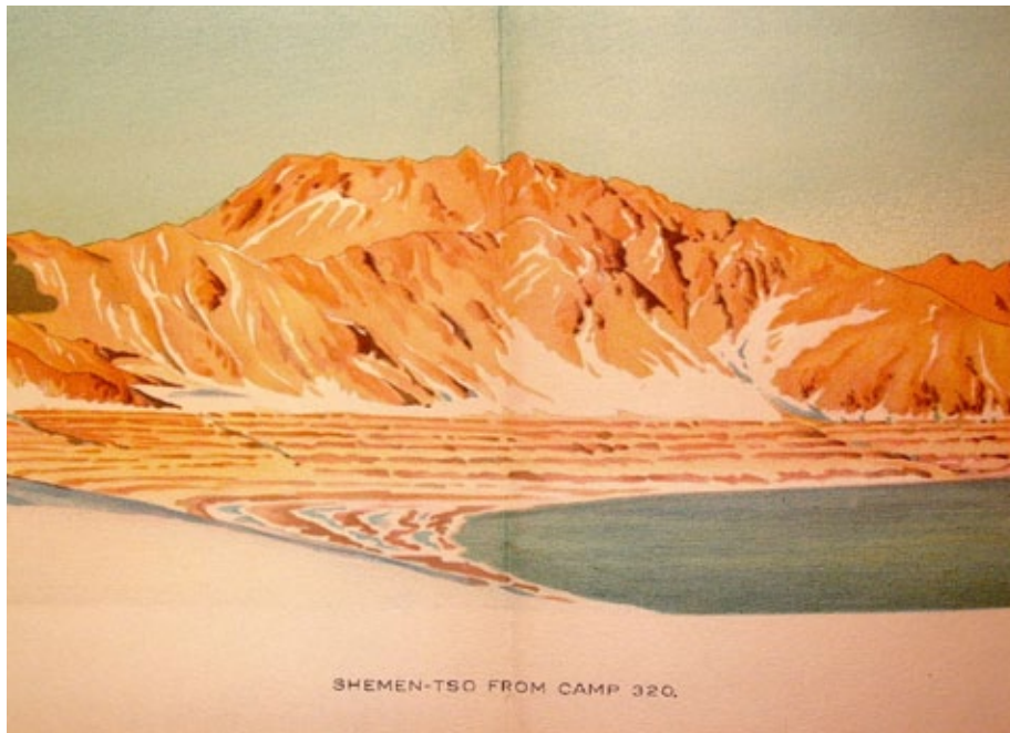
Figure 1: "Shemen-tso from Camp 320," drawn on 4 February 1908 [detail]. To indicate the progressive desiccation of western Tibet, Sven Hedin drew the receding shorelines of Shemen-tso Lake (elevation: 4,960 m). Sven Hedin, Southern Tibet Prospectus (Stockholm: Lithographic Institute of the General Staff of the Swedish Army, 1922). Colored panorama taken from Southern Tibet , vol. 4, pages 240a and 240b.

Basis of History , not only was climate changing, but this change was global. 23 He rejected Hedin's notion of oscillation, which assumed that wind erosion alone could alter local topography. 24 Due to its wide generalizations (e.g., "with every throb of the climate pulse, which we have felt in Central Asia, the center of civilization has moved this way or that" 25 ), The Pulse of Asia was poorly reviewed in London. Huntington demanded in vain that observations on lake elevations be connected to a thesis on climate change. 26 Unanswered, his question remained open for a while: was climate changing, and could we find an answer in the mountains and high plateaus of Asia? 27 In the winter of 1914, Prof. John Walter Gregory wondered aloud if the Earth was drying up. 28 By 1930 Gregory