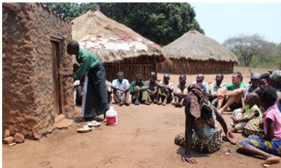
Figure 3: Mbamba ceremony. The regulo (district chief) of Kanda carries out the Mbamba ceremony on behalf of the author. It is customary practice for a visitor to Gorongosa Mountain to obtain the blessing of the regulo for a safe journey.

Despite their importance, oral history and traditions rarely lend themselves to easy interpretation and integration into a text. Memories do not come to mind without interference from the contemporary context. In the case of the Usambaras in 1991, the German aid agency, Gesellschaft für Technische Zusammenarbeit (GTZ), was in the process of implementing the Soil Erosion Control and Afforestation Project (SECAP), which in many ways mirrored very similar colonial efforts in the 1940s and 50s. People often wanted to discuss their grievances with SECAP in the context of earlier colonial efforts, which they likewise saw as unjust impositions.