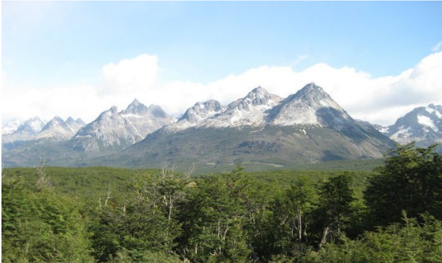
Figure 1: Sierra Valdivieso, Tierra del Fuego, Argentina, 2011.

How do historians balance exceptions against broader patterns to understand their significance? From the perspective of the image above, you can see the rising jagged peaks and the nothofagus forests below, but you do not catch a glimpse of the havoc exotic beavers have brought to the water coursing through peat bogs, nor are there indications that this range rises out of an island at the tip of South America. Mountains provide an illustrative way of thinking about historical scale. Setting and serendipity influence inhabiting communities that are molded by barriers and conduits the mountains create. But mountains alone don't explain how beavers ended up in Valdivieso. Mountains shape rather than determine the course of human history, and yet the contiguity of their features opens avenues of comparison, especially regarding time and space. 2 Instead of digging into their strata, let us consider mountains as metaphors for the challenges associated with the multiple levels of analysis an environmental history project might consider.