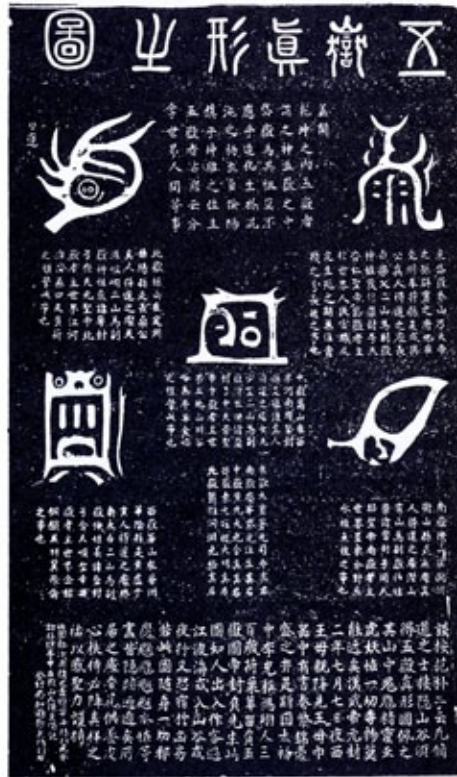
Figure 2: "Image of the True Form of the Five Peaks." The five holy mountains of the Confucian-Taoist tradition represented on a print from a stone column engraved around 1614. Edouard Chavannes, Le T'ai Chan. Essai de monographie d'un culte chinois (Paris, 1910).

In my view, Chinese mountain culture is also unique in a territorial sense. Mount Taishan did not stand alone; it was part of a vast system of holy mountains. The Five Peaks of the Confucian-Taoist tradition include, besides the Eastern Mountain (the most important of them), a holy mountain in the north, in the west, in the south, and in the middle of the Chinese Empire. Their heights are conspicuously modest (roughly 1,290 to 2,020 meters), and the distance between them quite considerable (over 1,400 kilometers from the Northern to the Southern Mountain). The Five Peaks were represented with particular signs and characterized by a series of quasi-administrative criteria. From experts in toponymy, I learned that the mountains had spoken names: “Tai” (Taishan, the Eastern Mountain) meant “prosperity, peace, and tranquility;” “Heng” (Hengshan, the Northern Mountain) meant “endurance and tenaciousness;” “Hua” (Huashan, the Western Mountain) meant “flower;” and so on. According to ancient Chinese literature the Five Peaks were early checkpoints for the inspections of the empire by the Emperor and his delegates. In general it was believed that the mountains ensured the stability of the Earth with their weight. In materialized form, the “Image of the True Form of the Five Peaks” represented a talisman of great protective power.