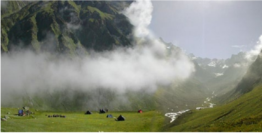
Figure 6: Great Himalayan National Park.

Through the years, the pleasures and rewards of working in the mountains have grown out of the difficulties and uncertainties. The exhausting bus rides, the occasionally futile searches for archival materials, the monsoon rockslides and unmet schedules: all have been counter-balanced by long walks, congenial meetings, sudden insights, and supportive colleagues. When long hours at the computer are rewarded by prose that flows easily and confidently, the sense of reward is all that anyone could require.