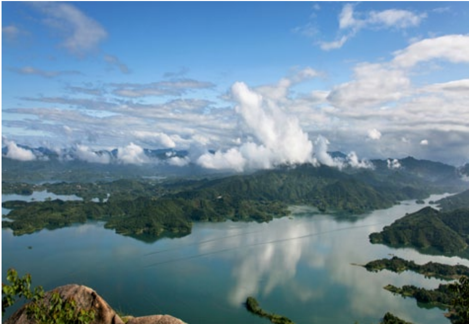
Figure 3: Huating Lake and Mountain of Dragon, Anhui Province, the birth place of Mei's father. The lake is actually a reservoir. It was built in the 1950s and caused Mei's family to migrate from the middle of the mountain to the plains.

early and brought some food and water along. Then we worked a whole day in the mountain valley and returned back home at dusk, carrying a load of pine needles. Of course, this work was very hard and beyond my capacity at that age, but it was a good test of my physical strength and psychological endurance. Strength and endurance are the kinds of qualities that Chinese attribute to their mountains.