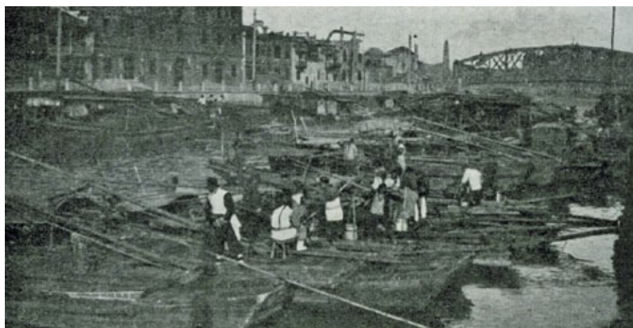
Figure 5: A flotilla of manure boats on Soochow Creek, collecting human wastes in the city of Shanghai, for removal to cultivated fields. Franklin King, Farmers of Forty Centuries .

A picturesque feature of the muck trade was the gondolas, or long narrow boats, devoted exclusively to distribution. Franklin King saw them in operation in the early twentieth century, collecting urban wastes in Suzhou and floating them far into the countryside. Men and animals brought pails of muck to large empty lots located outside the city, selling it at the rate of a cent per pail. Here the muck was spread, dried, and sanitized. Nearby were segregated docks designated for gondolas to tie up and load the fertilizer on board. “The boats,” King wrote in a letter, “are carefully washed outside and covered before leaving the city and the offensiveness of the practice is not nearly so great as you might think.” 37 Each year the city of Suzhou, from its foreign quarters alone, shipped out 276,000 tons (250,382 metric tonnes) of excrement.