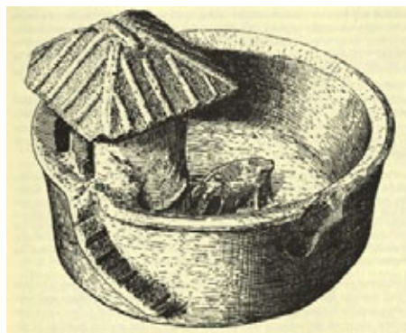
Figure 4: Han-era model of combined pigsty and human privy, from Joseph Needham, Science and Civilization in China , vol. 6, Biology and Biological Technology , bk. 2, Agriculture by Francesca Bray (Cambridge: Cambridge University Press, 2000), 291.

is, to be sure, an important clue from the Zhou and Han dynasties (1045 BCE to 220 CE, i.e., the age of Confucius). It consists of small clay models of pigsties that have been unearthed by archaeologists, generally from the rice-growing part of China. The models are for a type of building that may have housed pigs but also produced fertilizer from human waste. These are elegant-looking structures, with solid masonry walls enclosing a yard for keeping pigs on the ground level and a stairway that curves upward to a second-story toilet where people could sit and drop their excrement on the animals below. Perhaps they did so in a spirit of revenge! Folklorists say that the Chinese once identified pigs with an evil, powerful “toilet spirit.” Although they were the most common four-footed animals on farms, and the major source of meat, pigs could be seen as fierce, dirty, dangerous, and even contemptible.