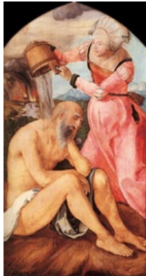
Figure 1: Albrecht Dürer, Job on the Dunghill, with His Wife , 1505 CE, Städel Museum, Frankfurt am Main. The Israelite is sitting dejectedly on a dunghill, pondering the injustice of the world, while his wife (dressed in contemporary German fashion) pours cold water over his feverish body covered with boils.

Our foraging ancestors feared with good reason their body wastes, which is why they trudged off into woods and bushes to do their business at a safe distance from cave dwellings and encampments. They understood that they were capable of despoiling their habitat. And when the woods and bushes became full of their wastes, they moved on. They resettled to find new food resources, but they also moved to escape those nasty waste products.