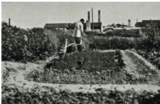
Figure 6: Applying liquid manure from carrying pails, using the long-handled dipper. Franklin King, Farmers of Forty Centuries.

Her synopsis ends at the mid-nineteenth century—when 432 million inhabitants were fighting for food where once there had been only 60 million. The pressure would not end there. 43 After 1851 the population went on increasing exponentially, until demographic curves were bending almost vertically upward, like a rocket heading straight into outer space.