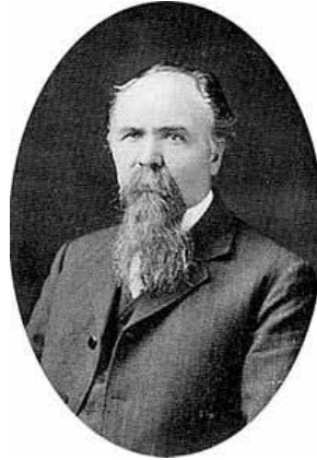
Figure 2: Franklin H. King. Published on the frontispiece of Farmers of Forty Cen- turies.

Before coming to China nearly two decades ago, the first book I read about its environment was the American soil scientist Franklin L. King's Farmers of Forty Centuries . 6 Still in print a century after its first publication, and recently translated into Chinese, the book's nearly four hundred pages describe a journey King made along China's eastern coast to learn about traditional, or what he called "permanent," agriculture. Sailing from Seattle, he reached Yokohama, Japan, on 9 February 1909 and Shanghai, China, on 2 March. From there he voyaged south to Hong Kong and Canton, then retraced his steps to Shanghai, where he spent many frustratingly idle days in the Astor House Hotel trying to figure out what to do next and where to go. Not far from that seaport city lay the fertile and prosperous Yangtze River delta, also known as Jiangnan, the most successful agricultural region in the country. After much delay he managed to travel through that region extensively, threading through its dense intertwined landscape of canals, rice paddies, and mulberry groves on a houseboat. Here at last he was able to study more closely China's methods of handling soil and improving fertility.