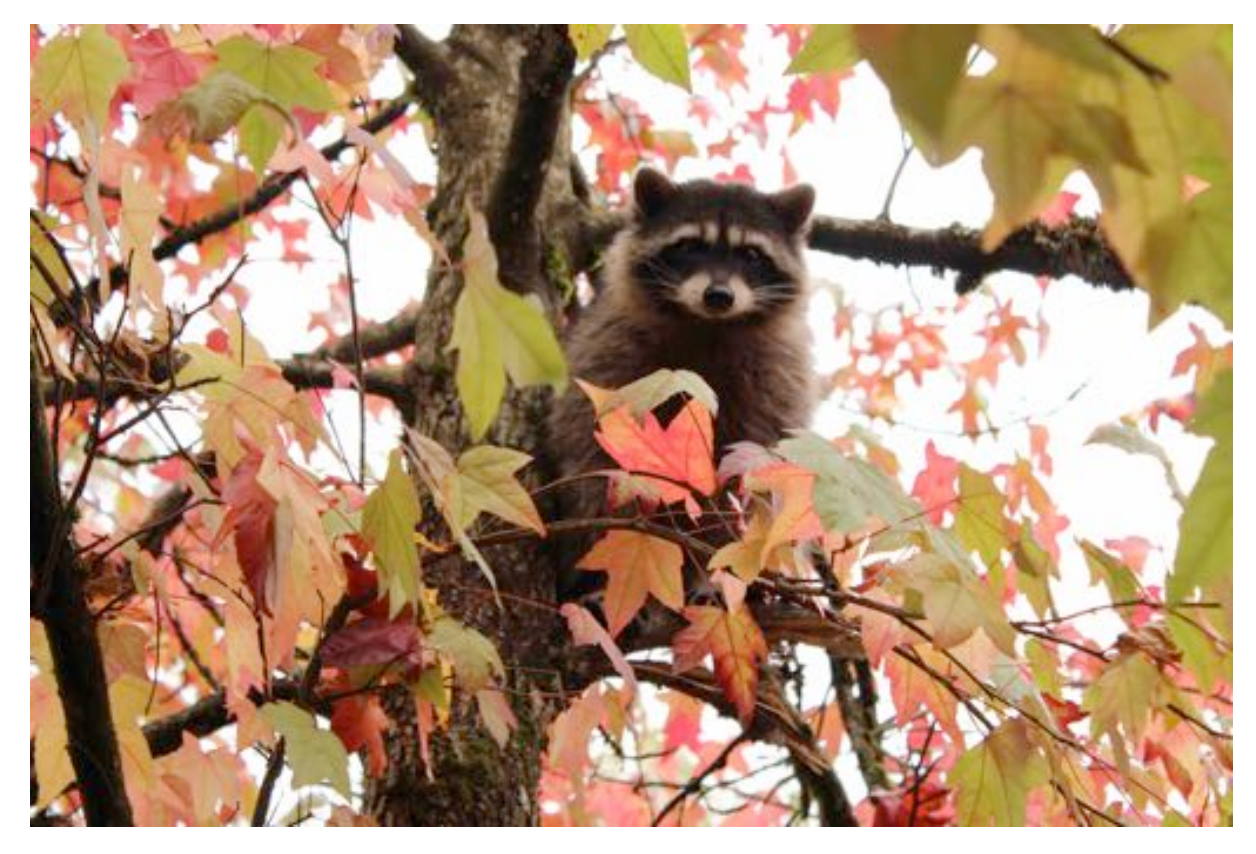
Figure 2. Raccoon in playground tree.

A third way raccoons cross the human/nonhuman divide is microbially, by infecting. As pests and "trash animals," <sup>35</sup> raccoons are perceived as infectious to humans (especially children) and their pets. Educators at the childcare complex have been advised, by both parents and childcare licensing officers, that not only are raccoons susceptible to carrying rabies, but their feces are infectious: humans might contract leptospirosis or salmonella by touching, digesting, or inhaling raccoon feces. The educators are particularly worried about raccoon worm. The raccoon is the primary host of an infectious worm known as Baylisascaris procyonis. <sup>36</sup> These worms develop in the raccoon intestine, producing millions of eggs that are passed in the animal's feces. The eggs become infectious after a two to four-week incubation period, after which they can survive in the environment for several years. Humans are infected if they ingest fertile eggs—and, because dominant developmental discourses maintain that children frequently put objects, hands, and dirt into their mouths, children are seen to be particularly at risk of infection.