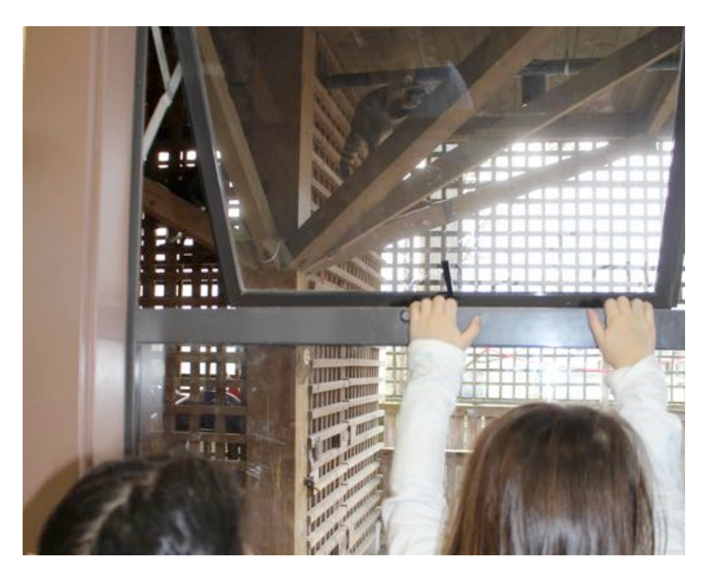
Figure 1 . Children watch the raccoons through the window.

The children's and educators' curiosity about the raccoons is tinged with disconcertment. Humans in the childcare centres are taken aback by the raccoons' similarities to them. Recognizing themselves in these racoons, they are attracted to them. This process is akin to what Levinas calls an 'ethics of recognition,' where we see ourselves in the face of the other. 27 However, the educators are threatened by the raccoons' bold wild-nature / domesticated-urban boundary-blurring behaviours. Even more provoking for humans is raccoons' 'naughtiness;' they are tricksters and jokers who sabotage carefully planted garden boxes, vandalize trash cans, rearrange the playground, tap on the classroom skylights, and play with the children's toys. These raccoons defy authority, resist human plans, ignore divides, and deviate from the expected path. In other words, they live up to their reputation as 'masked bandits' full of mischief.