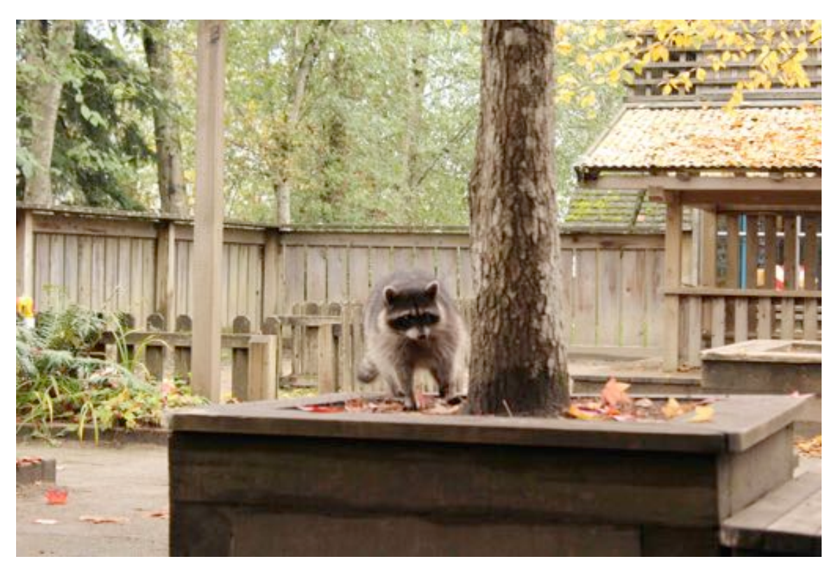
Figure 3. Raccoon in the playground.

In this childcare centre complex, educators feel ambivalent about the presence of the raccoons, and especially about the raccoons' insistence on crossing boundaries. The educators juggle their desire to develop the children's attachment to the raccoons with their duty of care to protect the children from the possible risks that exist when co-habiting with these animals. Mandated by British Columbia child care licensing regulations, they conduct regular playground inspections (including raccoon checks) to identify 'hazards' and 'non-conformances' against the playground standards. If necessary, they make adjustments to meet the mandatory requirements and provide a 'safe,' 'secure' environment for the children.