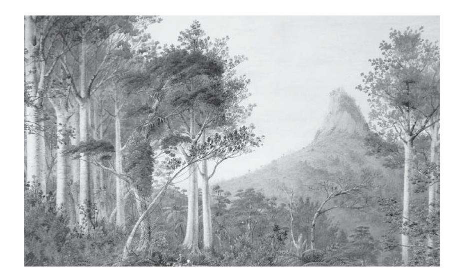
FIGURE 2. Alfred Sharpe was one of the few colonial artists to depict and protest against deforestation. Here two loggers, dwarfed by the kauri trees they will fell, stand in the middle foreground. 'Could not Government be induced to reserve a few hundred acres of the best of it, so that future generations may arise and call us blessed?', wrote Sharpe of another kauri forest in 1886. Among the Kauri, Castle Rock, Coromandel , 1884. Watercolour, 532 x 883 mm, private collection. Roger Buckley, The Art of Alfred Sharpe , (Auckland: David Bateman, 1992), plate 26, 74, (quotation) 127–8.

Sadly for Campbell Walker, his stay as Conservator was short: Parliament repealed the Act, a choice taken primarily for economic reasons. His influence, nevertheless, continued. The 1877 Land Act, designed to replace existing tree-planting legislation, incorporated some clauses of the defunct Forests Act. In