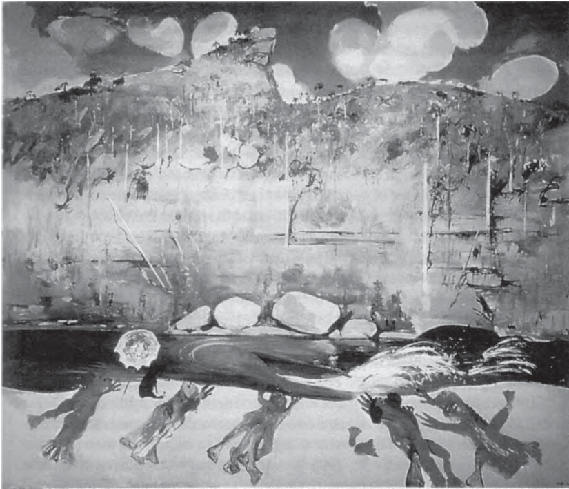
FIGURE 3: Arthur Boyd, 'Bathers, Speedboat and Pulpit Rock' (1985): Australian Galleries Pty Ltd. Reproduced with permission of the Bundanon Trust.

Australia, Philip Drew argued in 1994, is a 'littoral culture': the patterns of settlement along the coast defining a national identity more comprehensively than any preoccupation with the mythic bush. The more prosaic 1993 report of the Resource Assessment Commission on coastal management similarly affirmed that 'the coastal zone has a special place in the lives of Australians': it is where they want to live, or at least take their holidays; 'it is a priceless national resource'. 4