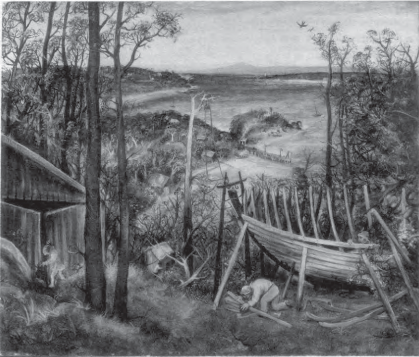
FIGURE 2: Arthur Boyd, ‘Boatbuilders, Eden’ (1948): National Gallery of Australia. Reproduced with permission of the Bundanon Trust.

Particularly since 1945, the marginality of this coastal region has been engaged in an increasing dialectic with the social, cultural and political changes which have characterised the centres of Australian life – from the tightening ecological, marketing and health regulation of vulnerable industries such as dairying and fishing, to the shifting aesthetics of the coast-as-recreation, to the campaigns to keep the south-eastern forests from the woodchipping mill on the southern headland of Ben Boyd’s revered Twofold Bay. In 1948 Arthur Boyd painted ‘Boatbuilders, Eden’ (figure 2), an evocation of this isolation at the farthest edge of the NSW coast: figures of Breughelian innocence working in the rough clearing of a forest that provides yet also mimics, even seems to reclaim, the bare ribs of their half-clad craft (Ben Boyd’s lighthouse can be glimpsed in the distance, near where the woodchip mill now stands). In 1985 Boyd painted ‘Bathers, Speedboat and Pulpit Rock’ on the Shoalhaven River (figure 3), at the other end of this region: a very different image of sunburnt bodies and raucous powerboats scarring a river which is also siphoned north into the pipes and taps of Sydney. This article seeks to draw out some of the significance of these overlapping histories, and of the dialectic between them.