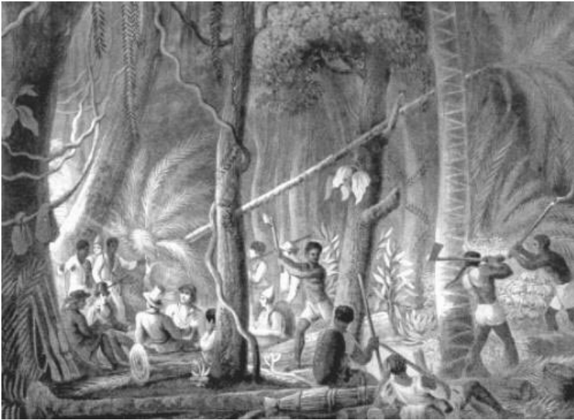
FIGURE 1. Deforestation permits the sunlight to touch the interior of the forest at the Mucuri valley. The traveller Maximilian is wearing a top hat. Maximilian, Viagem ao Brasil .

Once published in Europe, the accounts of Maximilian and Saint-Hilaire were incorporated in the enthusiastic debate about the New World. Both of them followed the tradition, pioneered by Humboldt, of representing tropical nature through the tropes of fertility and superabundance. 23 Besides the aesthetic experience of looking at pictures of nature, or measuring and scientifically classifying it, both travellers pondered upon the occupation of tropical nature and its dominion by agriculture and animal breeding.