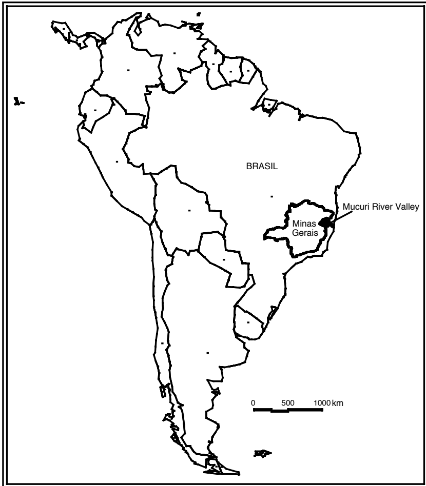
MAP 1. Mucuri River Valley. Compilation and analogical/digital conversion made by IGA – Applied Geosciences Institute, Minas Gerais, Brazil, 2002.

Mucuri Navigation Company was established to populate the region through trade and agriculture, by linking the interior of Minas Gerais to the south coast of Bahia.