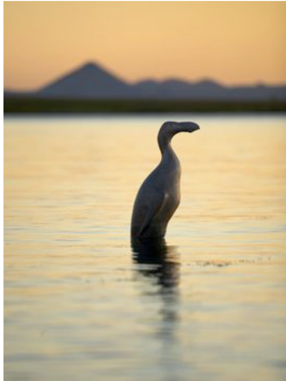
Figure 1 Geirfugl / Great Auk , sculpture in aluminium by Ólöf Nordal 1998.