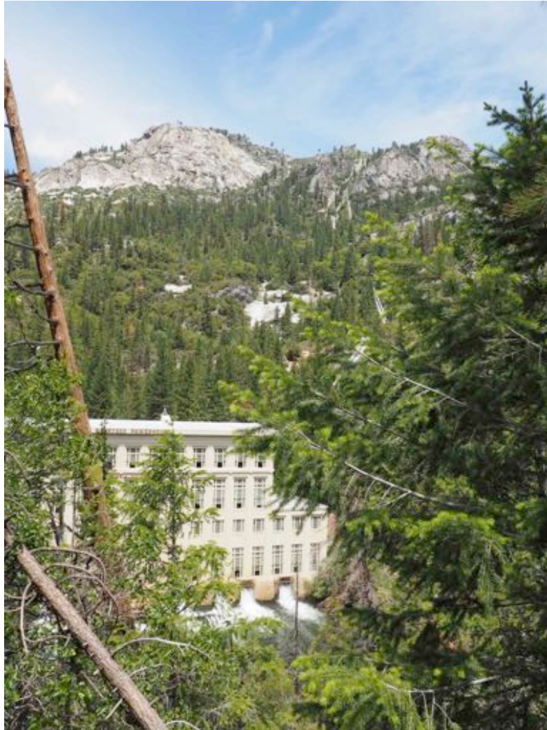
Figure 1. Big Creek Power House No. 1, which went into operation in 1913. The penstocks—high-pressure pipes carrying water from upstream reservoirs—can be seen on the mountainside above and just to the right of the power house.

sources, it is still capable of generating more than 1,000 megawatts—about the capacity of one of the reactors at Diablo Canyon, California’s only remaining nuclear power plant. 4 In the hope of capturing the interaction of birds and infrastructure on camera, I am following as closely as possible the high-tension transmission lines that connect Big Creek to a substation near Pasadena. There Big Creek’s power—supplemented by electricity generated at other facilities—is reduced to a lower voltage by transformers, directed into numerous smaller distribution lines, and delivered to consumers throughout the Los Angeles area.