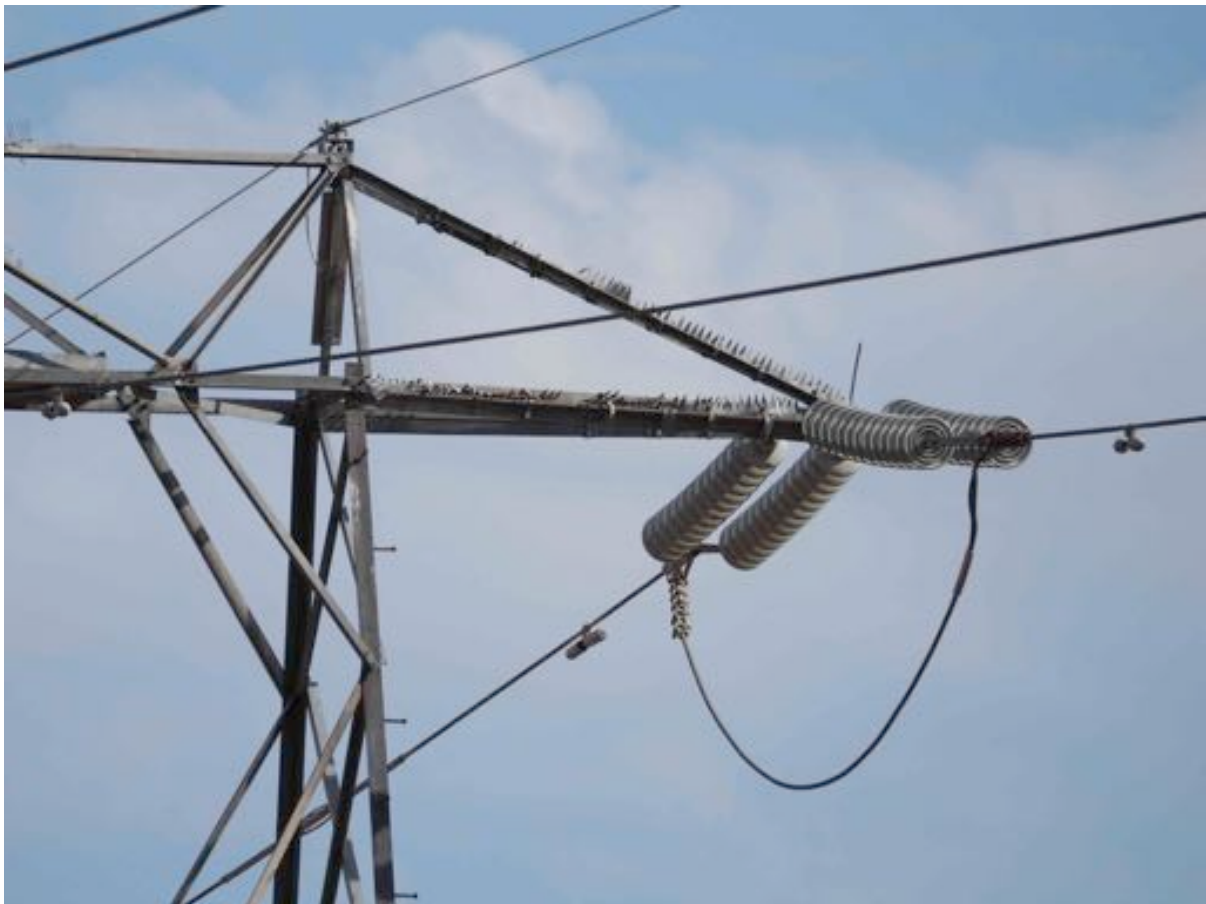
Figure 4. Spikes on the outer crossarms of one of the Big Creek transmission towers in the Central Valley of the kind that were first installed in 1924. The edge of a horizontal steel pan meant to catch bird excrement can be seen at the left. The smaller spikes on the crossbar above the central wire at the upper left of the image are a more recent innovation.

problems, four-foot lengths of thin galvanized iron, cut into a forbidding three-inch-high sawtooth pattern, were attached to the outer crossbeams (Figure 4). At the same time, the shield guards at the top of the insulator strings were removed, having proven not only unnecessary for protecting the insulators from high voltages but actually harmful, since they made for attractive perches. When it subsequently became clear that neither the pans nor the spikes alone sufficed, both were installed on most of the towers despite the expense. 47