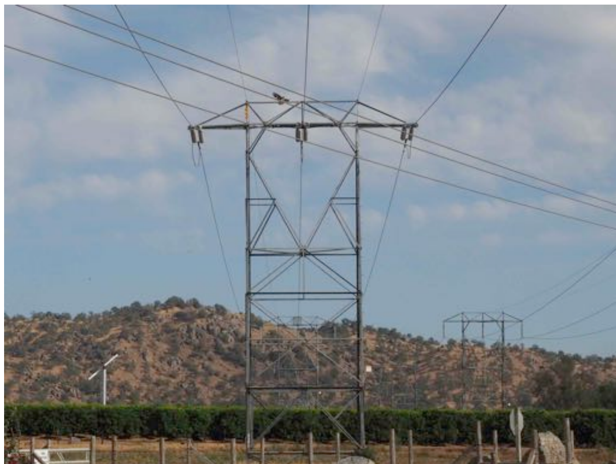
Figure 3. A red-tailed hawk landing on one of the Big Creek transmission towers near Sanger, California.

The red-tail flies off the tower after only a few minutes, but a pair of crows are soon squabbling in his or her place. The tower on which they are perched supports one of two parallel lines from Big Creek to the Eagle Rock substation near Pasadena. Each line consists of three wires, each of which carries alternating current at 220,000 volts and 60 cycles per second. (For reasons that exceed my grasp of electromagnetism, circuits composed of three wires are apparently better than two for electric power distribution.) 38 As I have learned from the Huntington Library's collection of Southern California Edison photographs and other sources, the pans and spikes that are visible on the towers have been in use since the 1910s or 1920s to minimize the impact of birds on electric power transmission. They are what one might call bioinsulators: devices and practices meant to isolate the system from its living environment. Such forms of insulation are essential to the existence of autonomous organisms;