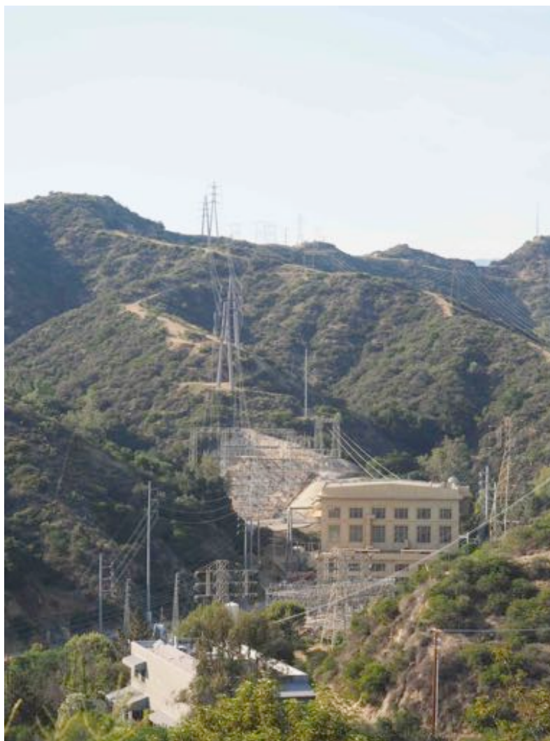
Figure 6. Eagle Rock Substation near Pasadena, California. The transmission lines from Big Creek are in the background running up the hill; lower-voltage distribution lines heading toward Los Angeles can just be seen at the lower left-hand corner of the image.

demand, and it did so not merely through redundancy but also through automation, which allowed the system to rapidly shift load between different parts of the grid and adapt to interruptions. This automation was partly electrical and partly social; it depended as much on the training and vigilance of operators as it did on the configuration of lines, relays, and switches. Interconnection also brought new risks; as the widespread blackout in eastern North America in 2003 showed, the more complex and interdependent the power system becomes, the less predictable the behavior of the system as a whole can be. 61 Nonetheless, despite such eruptions of unexpected agency, the overall impact of interconnection was to bolster stability.