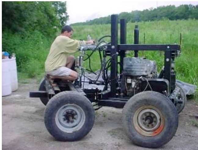
Figure 3. Jakubowski experiments with a tractor with an articulating chassis.