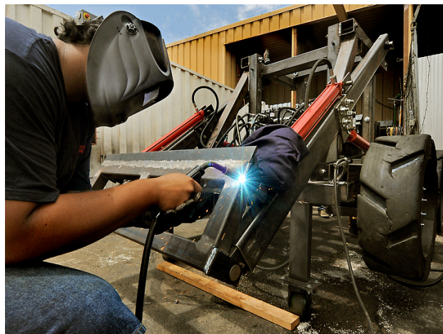
Figure 4. A worker replicates the OSE tractor in California.