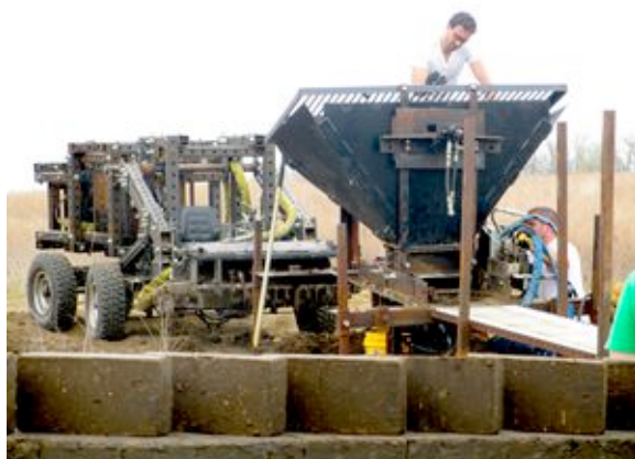
Figure 1. The OSE compressed earth brick press creates bricks with high thermal mass from raw soil for use in passive solar construction.

Such a radically localized material economy would rely on the widespread application of emerging digital technologies, particularly computer numerically controlled (CNC) manufacturing. CNC manufacturing can be either subtractive, as with CNC machining using routers, water jets, or lasers, or additive manufacturing, a.k.a. 3-D printing. This technology is especially important to the OSE vision because it has the theoretical potential to obviate economies of scale, making one-off production of uniquely tailored designs nearly as efficient as assembly line production of stock products. However, the full decentralizing potential of 3-D printing can only be realized to the extent that digital design files are open-source and publicly available. In this sense, the radically localizing potential of an open source economy largely depends upon the maintenance of the radically globalizing infrastructure that now enables information to flow freely on the internet. 33 It also depends upon innovators taking a leap of faith to share their ideas, but it is a leap that some are already taking on the wager that in an ever accelerating capitalist environment the economic benefits of collaboration and networking will outweigh the benefits of closed-door R&D. 34