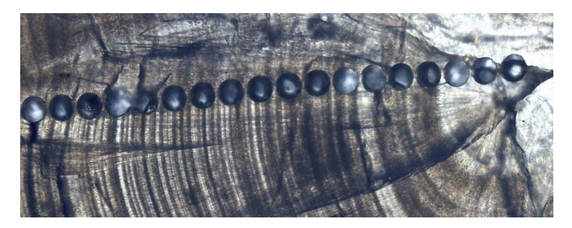
Figure 4. An otolith cross-section that has been placed under magnification. The holes mark where samples for isotope analysis have been extracted with a laser ablation multi-collector inductively coupled plasma mass spectrometer.

vary depending on the water through which a fish swam. Not only does saltwater have different trace minerals from freshwater, but different streams, and even different parts of the same stream, have different mineral contents depending on the types of rocks over which they flow.<sup>51</sup>