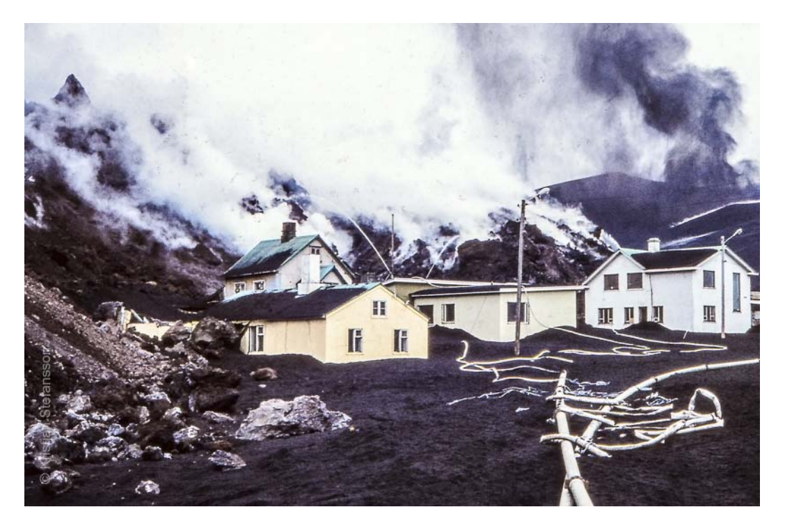
Figure 3. Cooling of lava, Westman Islands, 1973.

mainly the responsibility of Jónsson. After weeks of intensive pumping and the movement of pipes and people back and forth, the lava flowed eastward, away from the harbor and into the ocean. According to the United States Geological Survey, this was "the greatest effort ever attempted to control lava flows during the course of an eruption."<sup>39</sup> Eventually, the volcano cooled down. On July 2, Sigurgeirsson descended into the crater and declared the eruption "over," sending the local team into jubilation. It was time for Westman Islanders to move back and resettle.