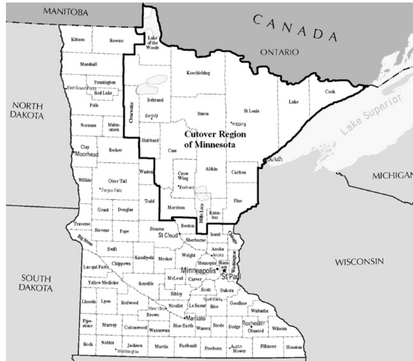
Figure 1. Map of Minnesota, with Cutover Region emphasized