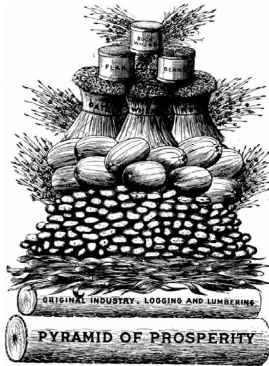
Figure 2. “Pyramid of Prosperity”