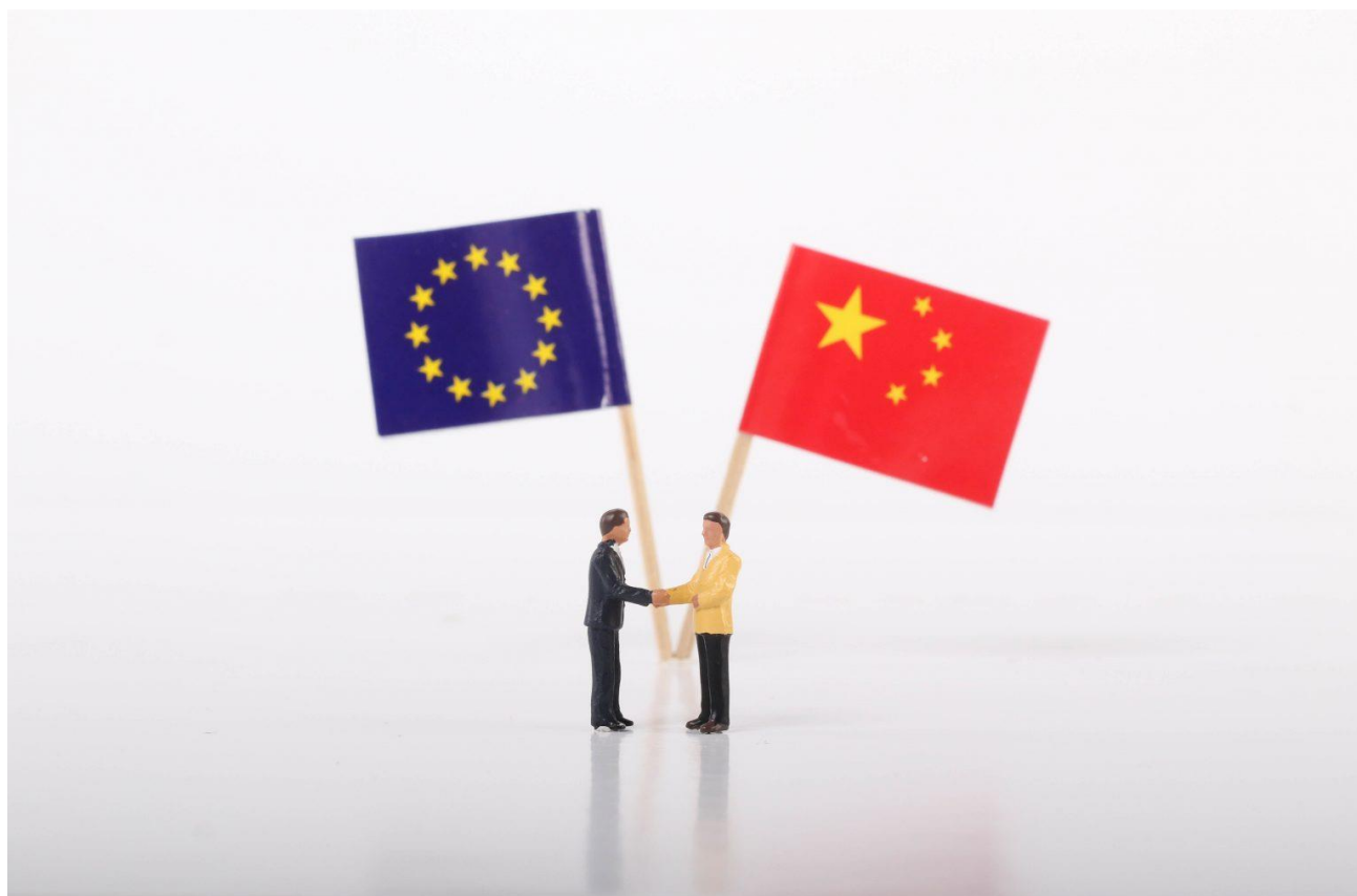
Photo of two businessmen shaking hands in front of flags of the European Union and China.

The media covered the announcement as a demonstration of Europe's pushback to China's Belt and Road Initiative. Was Europe throwing down the gauntlet to the PRC in order to stand side by side with the United States? Many journalists seemed to think so and focused their analyses on whether Europe was in fact too late in coming up with a concrete plan to help the Global South grow and transform in light of the fourth industrial revolution and the worsening climate crisis. Some thought that because China had already spent $140 billion on BRI projects, it had gained too much ground for Europe to have a lasting impact. The PRC, they claimed, has deeper pockets and a more centralized control of financial instruments, whereas Europe was still planning to rely on public and private financing for Global Gateway projects. 11