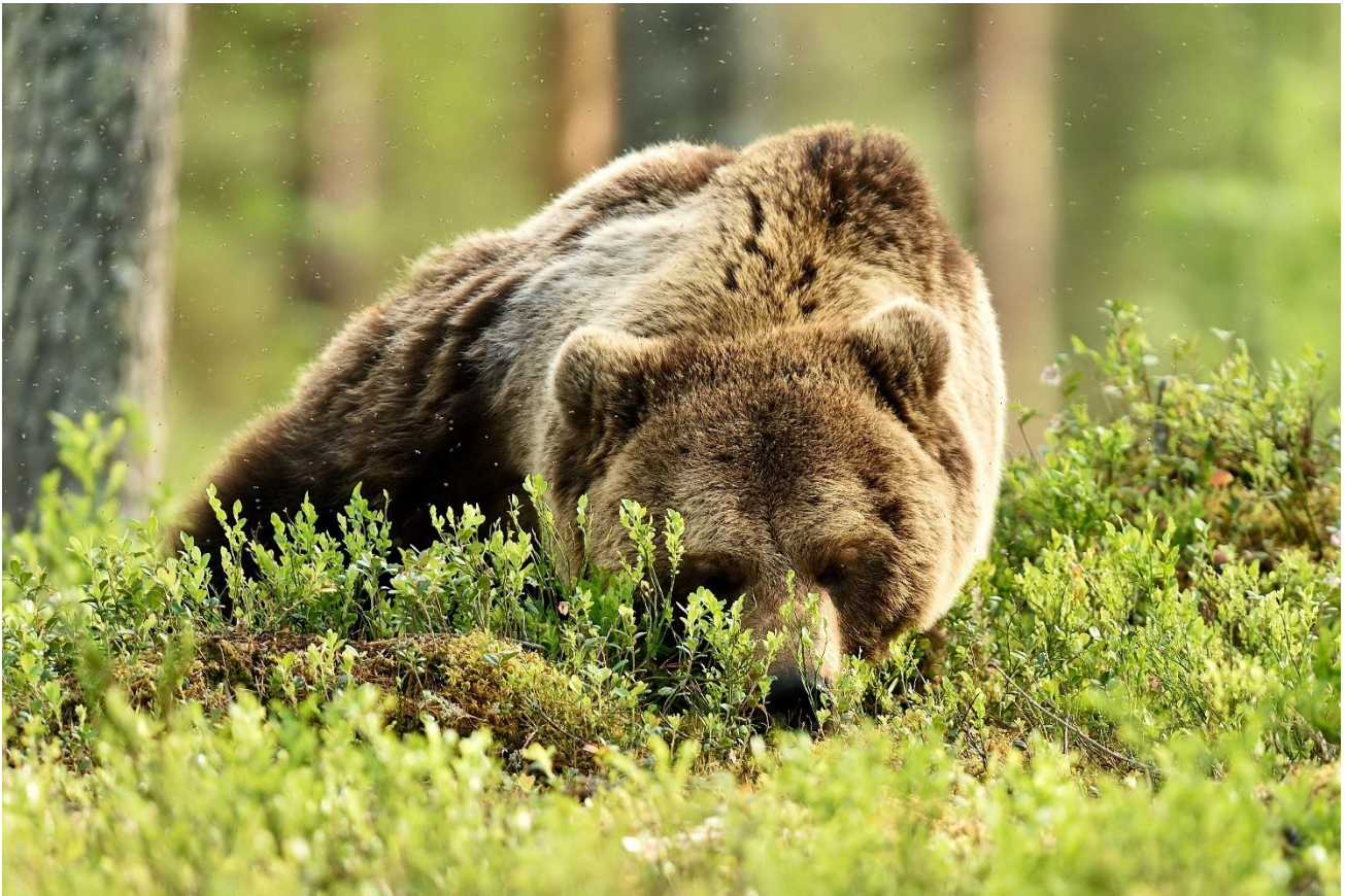
Sleeping brown bear.

I can't quite remember when I first pulled a camping mat and sleeping bag under my covered back deck and hunkered down for the night. That makeshift arrangement has evolved into a full-size bed, down duvets, and a secure sleeping space. But I do know why I sleep outside. I do it because I am nature: Because I am less than whole when separated from the wind, the rain, the scent of earth, the rising crescendo of geese calling as they migrate through the night. I sleep outside because I am less alive within the sterile confines of monochromatic walls and temperature-controlled interiors, no matter how much I admire and appreciate their aesthetic design and beauty. I sleep outside because I cannot stand to miss even a single morning of spring birdsong, the chill of winter on my nose, or the moment when dusk turns to night. I sleep outside because I like the shock of leaving my cozy bed to hurry to the bathroom across a frozen, moonlit night, and the joy of returning to the warmth of my outdoor nest.