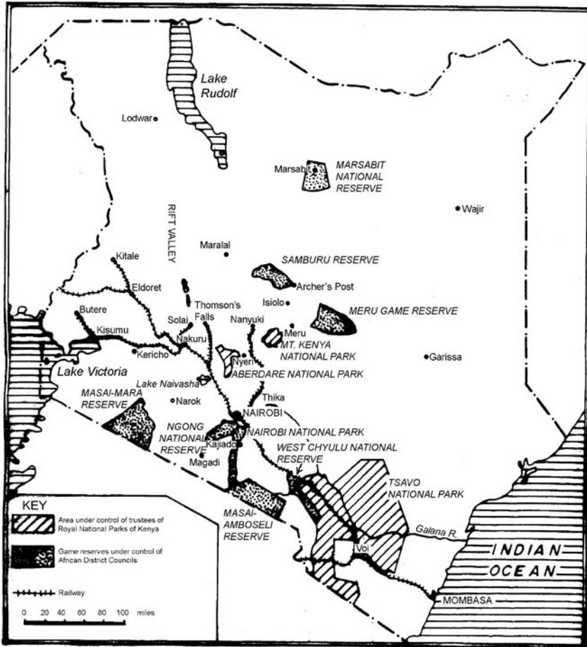
MAP 2. Wildlife sanctuaries by the early 1960s

of mounts Marsabit and Kulal. Although the area was not as rich in wildlife as Maasailand, the trustees considered the national reserve a worthwhile acquisition as it would 'be many years before the needs of the inhabitants force[d] game out of the area'. 30 The reserve was also considered home to unique sub-species like the greater kudu, reticulated giraffe, oryx beisa and Grevy's zebra – besides fair numbers of all the major mammals found in Kenya.