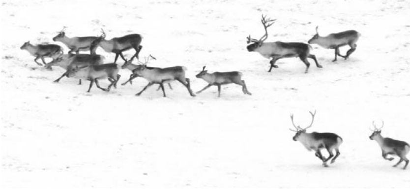
FIGURE 3. Reindeer in Iceland.

Iceland provides insight into the Enlightenment visions of the 'improvement' of the island. 15 The first proposal to buy reindeer in Norway and transport them to Iceland was in 1751. 16 This idea did not come to fruition, however, and the first animals did not actually arrive in Iceland until 1771. The years between 1751 and 1771 were particularly hard ones for the island: there was a famine from 1751 to 1758, and in 1761 an outbreak of scabies and lung disease among the English sheep that had come to Iceland, which lasted until 1770. The resumption of the plans to transport reindeer in 1771 after the twenty-year hiatus can probably be attributed to the worsening conditions and the perceived need for a particularly hardy animal to replace the sheep population, which had declined by 60% in the last nine years. In general the requests and inquiries for shipments of reindeer were made with reference to the specific hardships of the Icelandic eighteenth century. For example, another shipment of animals was sent by an Icelandic priest living in Norway when he heard the news of the volcanic eruptions in Iceland in 1783. 17