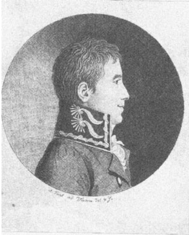
FIGURE 1. Chief Justice of Iceland Magnús Stephensen in 1808, when he was 46 years old.