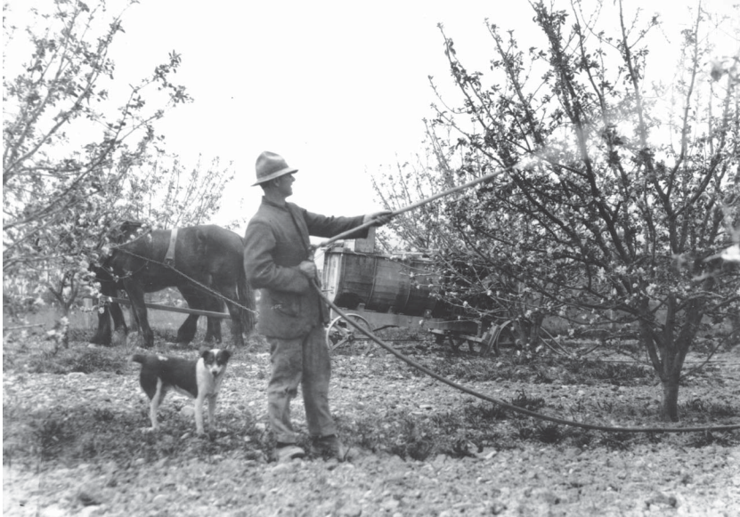
FIGURE 2. Spraying fruit trees was part of the male orchardists' work routine. Note the absence of any protective clothing. The dangers of spraying to consumers and the orchardists were down played even in the aftermath of the UK arsenate scare of 1926.

Spraying was essentially unregulated until 1913 when the Department of Agriculture issued certificates of competency in spraying and pruning. Subsequently there were few restrictions on the use of orchard sprays. Voluntary certification operated from 1937 but compulsory registration of orchard sprays was not required in New Zealand until 1959.