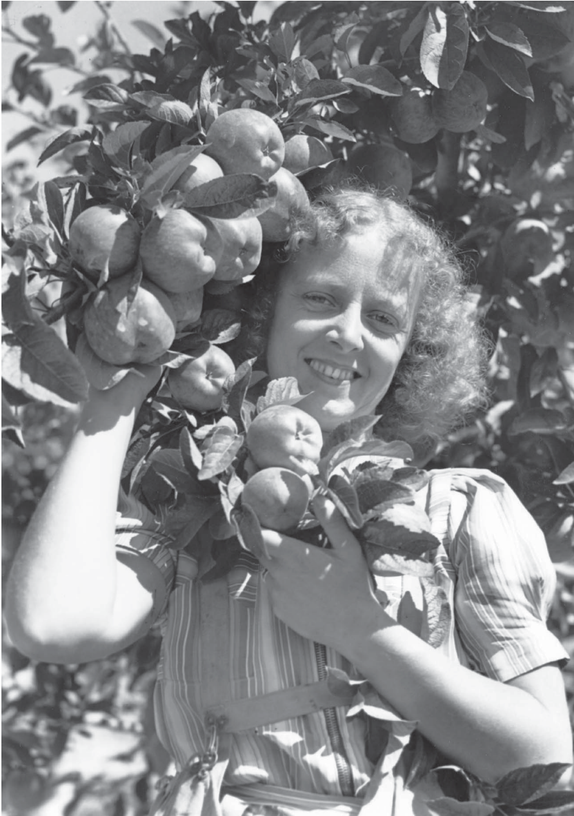
FIGURE 1. The pictorial record of the Nelson apple industry is replete with images of young women posed with trees in blossom, with ripe fruit and actually picking fruit. Harvesting was, however, typically undertaken by men, women and children, though sorting and packing fruit was typically women's work, while pruning and spraying were carried out by men.