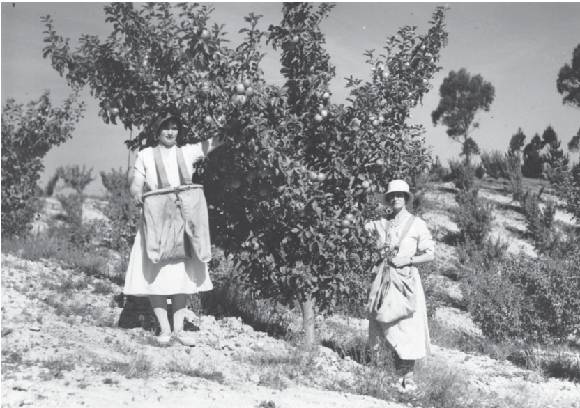
FIGURE 3. The actual experience of orchard establishment on the Moutere Hills was somewhat at odds with the promotional material. This family is shown picking fruit in what is still a comparatively barren landscape.

Grown under quite specific environmental conditions, fresh fruits are seasonal and perishable. Apples among fresh fruits are comparatively durable, but to ship