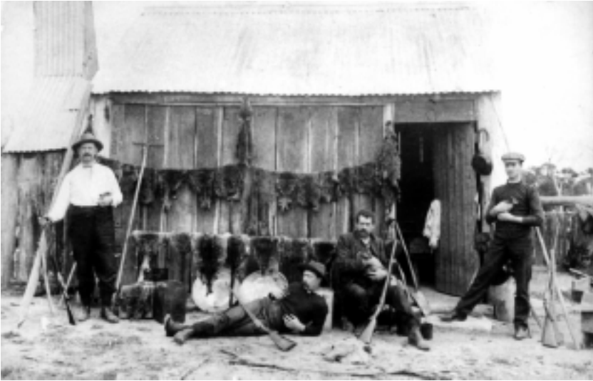
FIGURE 3. Pademelon pelts, Bullio, Mittagong, NSW, 1907.

which he was able to assist the Society to expose the clandestine export trade in marsupial skins) as well as a genuine interest in fauna preservation. 67