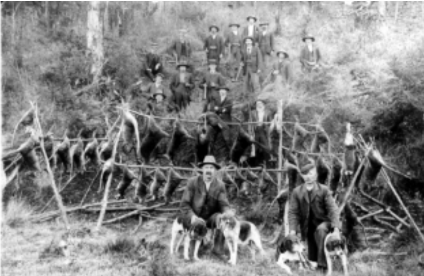
FIGURE 2. Pademelon and wallaby shoot, Bega, NSW. Beagle dogs were used to flush out the game.

A detailed study of the effects of this legislation on the marsupial fauna of the colony has not been attempted here, but some indication of its effectiveness in destroying unwanted fauna can be gauged from the numbers of scalps on which bounties were paid by the Pastures and Stock Protection Boards within the northern rivers region, in the north-eastern corner of the colony, during the first decade-and-a-half of operation of the system (Table 1). The dominance of pademelons in these figures reflects the rapid expansion of settlement into the brush (rainforest) lands of the Tweed River catchment and the eastern part of the Richmond River catchment from the mid-1880s. The pademelon ( Thylogale spp.) is a small, compact-bodied macropod which inhabits rainforest and tall open-forest with dense understorey. Its habitat was greatly reduced by the expansion of agriculture and dairying into such areas, although it thrived on the crops of maize and pastures of exotic grass which replaced the native vegetation. The settlers attempted to reduce their numbers through organised 'paddy drives', such events also becoming popular social and sporting occasions (Figure 2). 39