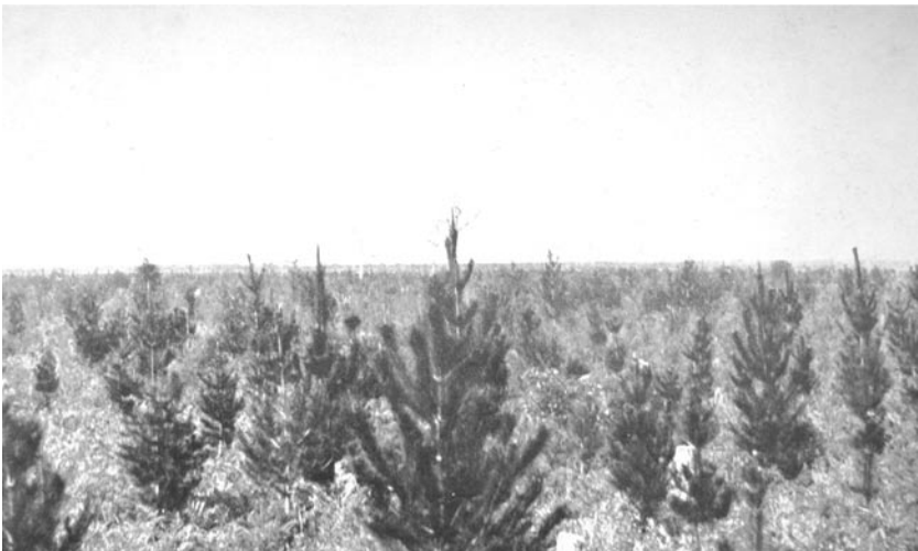
FIGURE 5. Young pines at Tuncurry, 1918 (NSW Department of Prisons, Report of the Comptroller-General of Prisons, New South Wales for the year 1918 )

Tuncurry seemed a wonderland to others, too. Just as remarkable transformations were observed in the men at the camp, the landscape, too, seemed miraculously changed. Snakes, though plentiful in the area, were said to be nowhere to be seen at the camp itself. Not only was the serpent banished from the garden, but the native wildlife at the camp lived in almost biblical amity