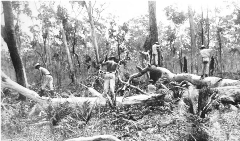
FIGURE 2. Tuncurry prisoners at work clearing scrub, 1913