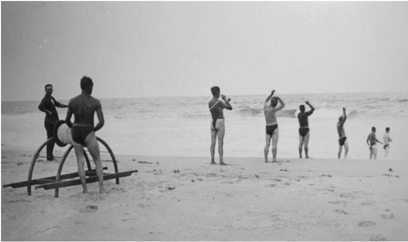
FIGURE 4. Surf lifesaving drill, Tuncurry, c.1930

relationship to the land. They are all images of men dominating their environments. Each picture presents a key landscape to the Australian imagination – the bush, the beach, the sporting ground – each of them tamed and controlled by men in turn subject to discipline, playing by the rules. Rehabilitated men and reclaimed land went hand in hand. 26