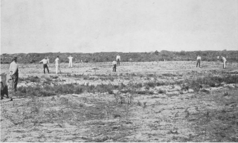
FIGURE 3. Prisoners at Tuncurry, playing cricket, 1918 (NSW Department of Prisons, Report of the Controller-General of Prisons, New South Wales for the year 1918 )

otherwise ... and the prison authorities in Maoriland have themselves expressed dissatisfaction with it a score of times.' Finally, he believed the scheme provided few opportunities for released prisoners to develop skills that might keep them out of trouble after being released: