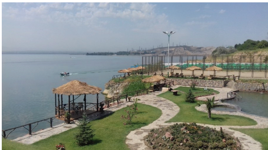
Figure 2 Bahoriston resort, north bank of the Kairakkum reservoir, aka the Tajik Sea, 2017. The manicured lawn and artfully landscaped pool in the foreground con- trast with the forest of high voltage electricity pylons from the nearby hydroplant visible in the background.

dle-class aspirations, such as a nice car, an office job, and weekends in the countryside. Unlike most of the country, which is mountainous, Khujand lies in the Ferghana Valley and is the valley's only city to have been built on the banks of the Syr Darya river, which bisects it. I was taken to apricot orchards, between the city limits and the expanse of cotton beyond, and began to hear stories of the upheavals the twentieth century had visited upon the local population.