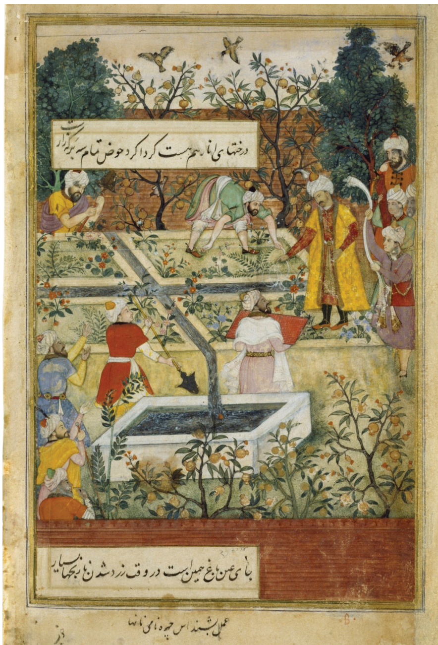
Figure 1 Babur supervising the laying out of the Garden of Fidelity. Miniatures from an illustrated copy of the Baburnama prepared for the author's grandson, the Mughal Emperor Akbar, attributed to the painters of Babur via Wikimedia Commons.